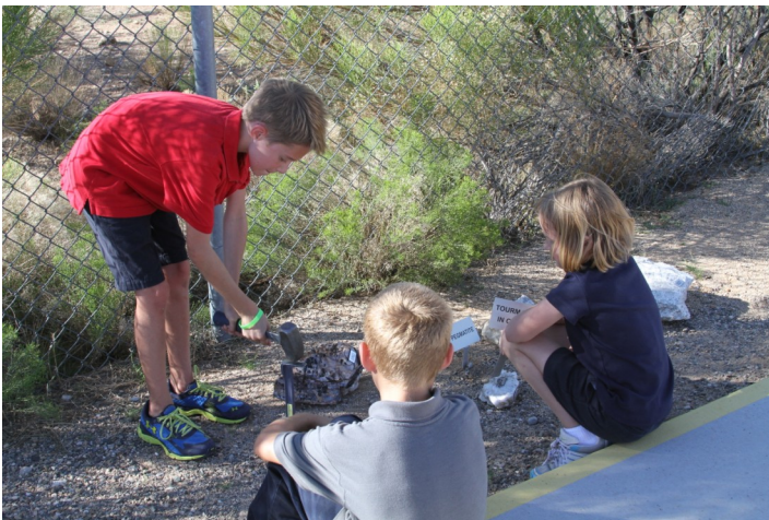
Students of Congress Elementary School help install signage along the Rock Walk.