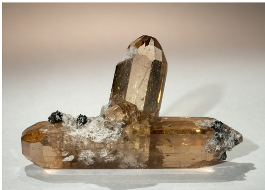
Beautiful sherry-colored topaz crystals from Topaz Mt., Utah The crystals formed directly from hot vapors permeating the gas cavities within the light gray 6-7 my old Topaz Mountain Rhyolite. These crystals fade to clear in sunlight.

LORE: Topaz was once thought to cool hot water or anger; to strengthen one's mind and prevent mental illness; to ward off sudden death; to treat asthma and insomnia when added to wine; and to improve vision.