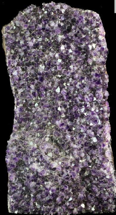
Amethyst crystal slab