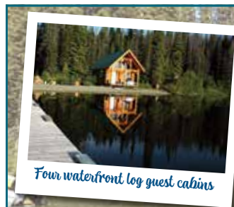
Four waterfront log guest cabins