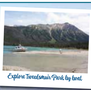
Explore Tweedsmuir Park by boat

Welcome everyone... to the 79 th Annual Lakes District Fall Fair!