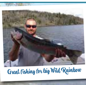
Great fishing for big Wild Rainbow