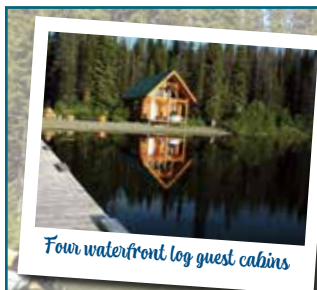
Four waterfront log guest cabins

2 or more breeds may be amalgamated, if not enough numbers in one breed for a class of it's own