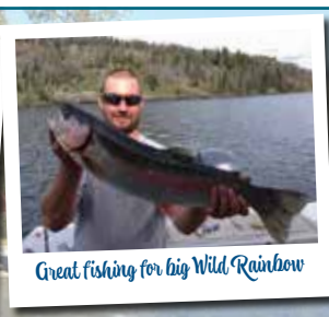
Great fishing for big Wild Rainbow