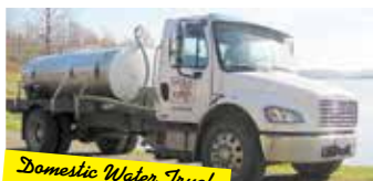
Domestic Water Truck