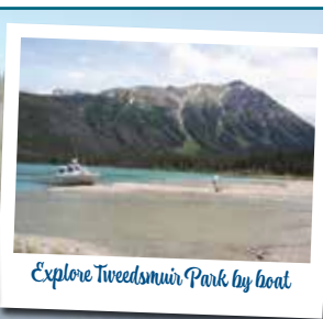
Explore Tweedsmuir Park by boat