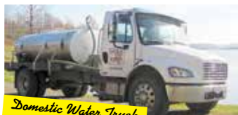
Domestic Water Truck