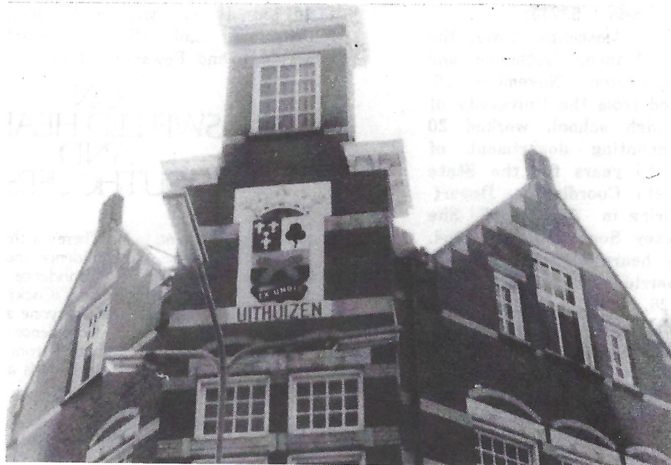
THE TOWER OF UITHUIZEN, HOLLAND