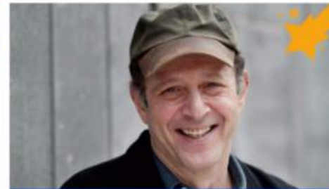
Trailblazers: Steve Reich - Music for 18 Musicians (excerpt)

Download KS2 lesson plans and powerpoint slides.