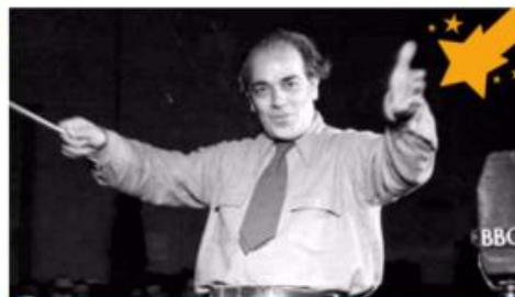
Trailblazers: Heitor Villa-Lobos - Bachianas brasileiras No. 2, The Little Train of the Caipira (finale)

Download KS2 lesson plans and powerpoint slides.