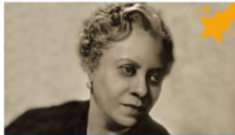
Trailblazers: Florence Price - Symphony No. 1 in E minor (3rd mvt)

Download KS2 lesson plans and powerpoint slides.