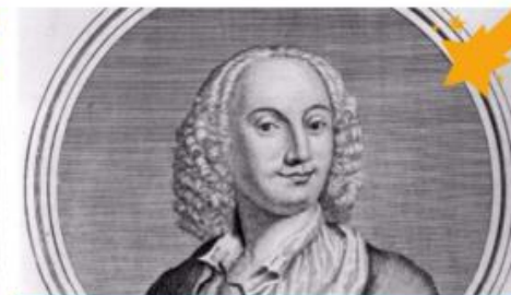
Trailblazer: Antonio Vivaldi - 'Winter' from 'The Four Seasons', Allegro non molto (1st mvt)

Download KS2 lesson plans and powerpoint slides.