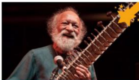
Trailblazers: Ravi Shankar - Symphony – finale (excerpt)

Download KS2 lesson plans and powerpoint slides.