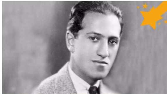
Trailblazers: George Gershwin - Rhapsody in Blue (excerpt)

In years 4,5 and 6 Music is taught by a music specialist who can really stretch and excite the children with music from all genres and periods of history. This scheme of work is largely based upon the BBC Ten Pieces scheme of work, which offers flexibility to choose pieces of music which are appropriate to different topics or events in school and look at them in detail. These children are guided to become composers and performers – imitating the styles of the great composers. They are also encouraged to begin to understand how to notate music in different forms – using graphic scores as well as traditional staff notation.