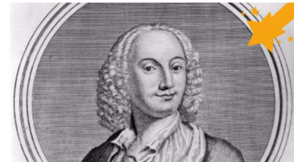
Trailblazer: Antonio Vivaldi - 'Winter' from 'The Four Seasons', Allegro non molto (1st mvt)

Download KS2 lesson plans and powerpoint slides.