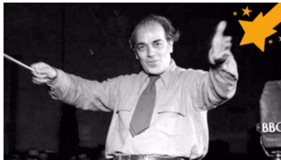
Trailblazers: Heitor Villa-Lobos - Bachianas brasileiras No. 2, The Little Train of the Caipira (finale)

Download KS2 lesson plans and powerpoint slides.