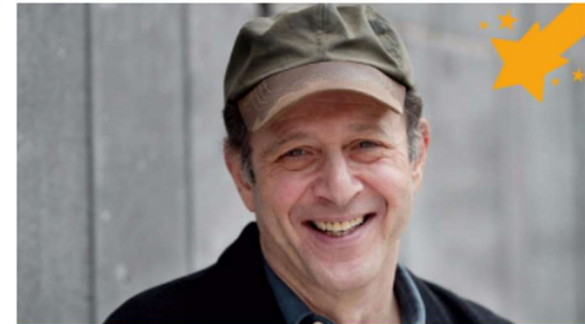
Trailblazers: Steve Reich - Music for 18 Musicians (excerpt)

Download KS2 lesson plans and powerpoint slides.