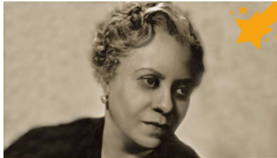
Trailblazers: Florence Price - Symphony No. 1 in E minor (3rd mvt)

Download KS2 lesson plans and powerpoint slides.