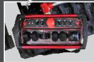
Available with Wireless Remote Control