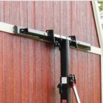
HYDRAULIC T-BAR 1