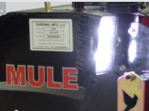
3. LED Work/Strobe Lights (3 Ct.)