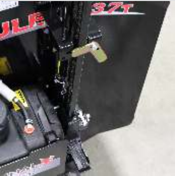
JACK HOLDER 1