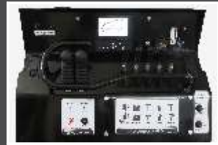
Electronic and Mechanical Hydraulic Controls