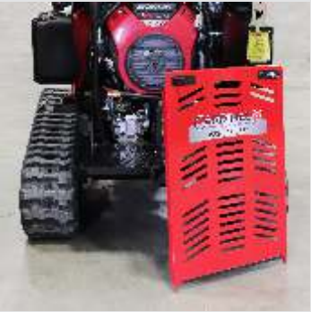
LATCH-IN HOODS 1