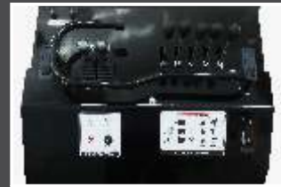
Mechanical Hydraulic Controls