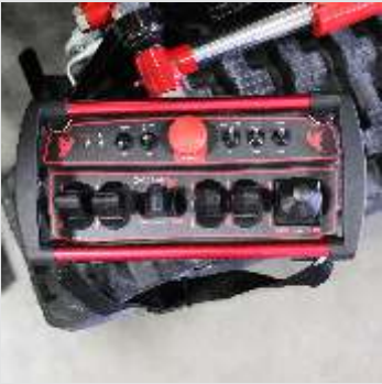
WIRELESS REMOTE CONTROL 4