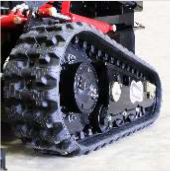
I-TRAX TECHNOLOGY 6