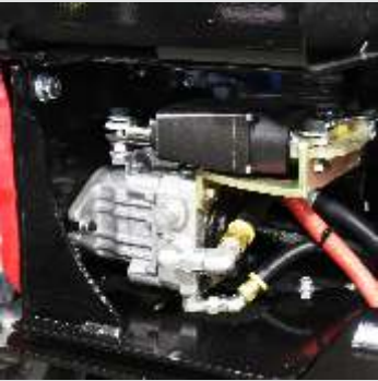
VARIABLE DISPLACEMENT HYDROSTATIC DRIVE SYSTEM 1