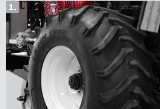
1. Fluid-Filled or Foam-Filled Drive Tires