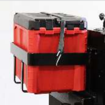
TOOLBOX AND LEVEL HOLDER 2