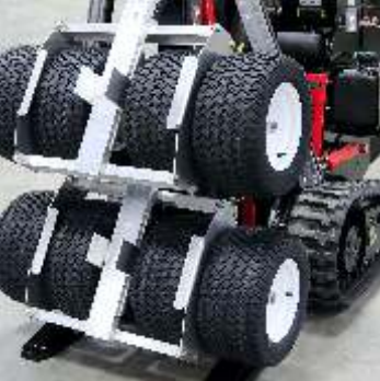
10K EZ STOW ALUMINUM DOLLIES 7