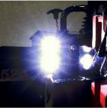
LED WORK/STROBE LIGHTS 2