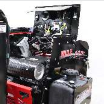
EASY ACCESS DASHBOARD 6