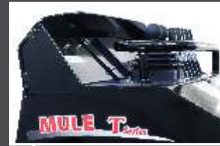
Recessed On-Board Diagnostic Screen