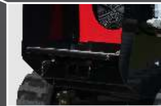
Shock-Absorbing Step Plate Operator Station