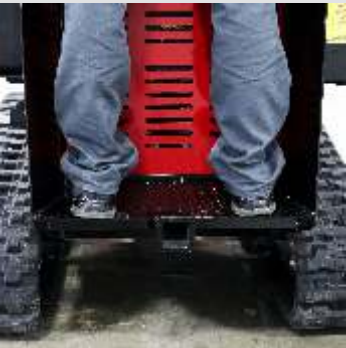
RIDE-ON OPERATOR STATION 1