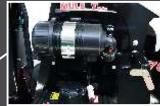
External Air Cleaner