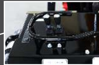
Hydraulic Pilot Drive Controls