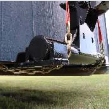
BARN HOOKS 1