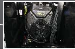
Latest generation 40 HP EFI Vanguard engine