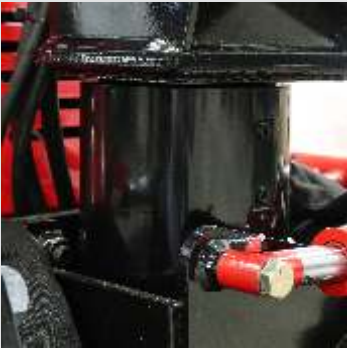
POWER ROTATOR 7