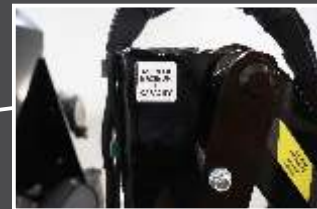
12,000 Lift Capacity