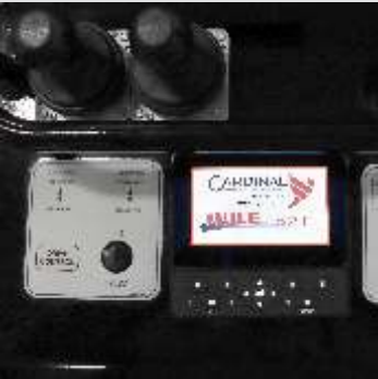
LCD INFORMATIONAL SCREEN AND DIAGNOSTIC CONTROL 3