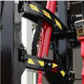
ARCHED MAST ARMS 5