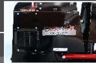
Larger Hydraulic Oil Capacity and Hydraulic Oil Cooler