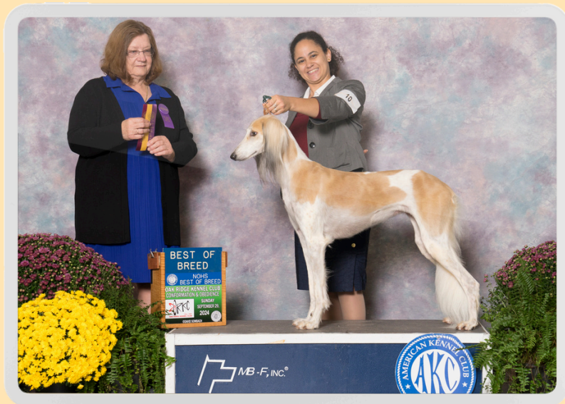
Oakridge Kennel Club - BOB and OH Group 2 Champion Hayat Sarea From Heir to Eternity i Eisa JC “Siobhan”