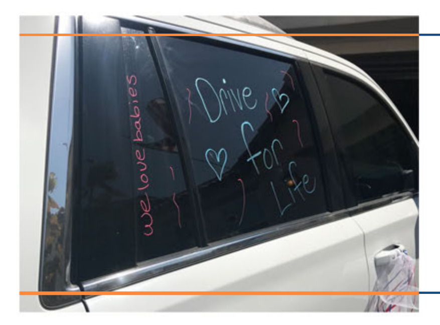
Step 3 : Write messages Use chalk paint markers on windows, or write messages on poster board and place in window.