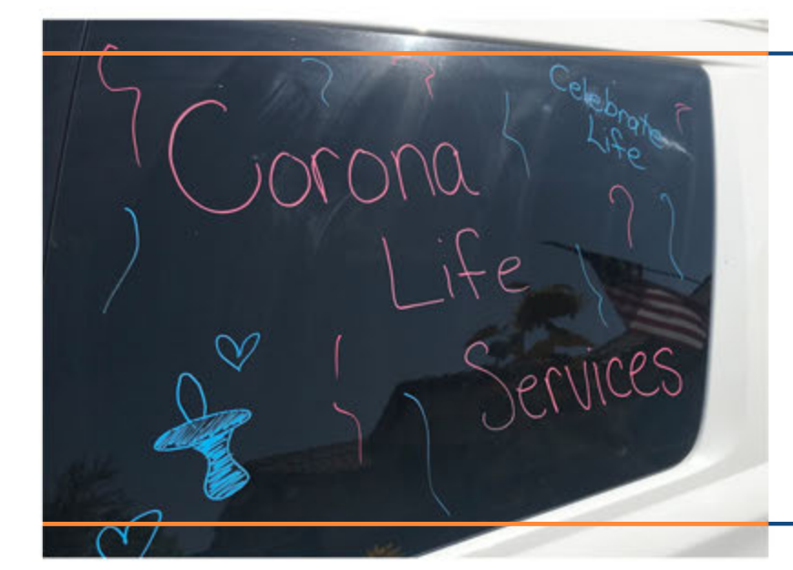
*Please remember to not block your vision in anyway that will effect your driving.