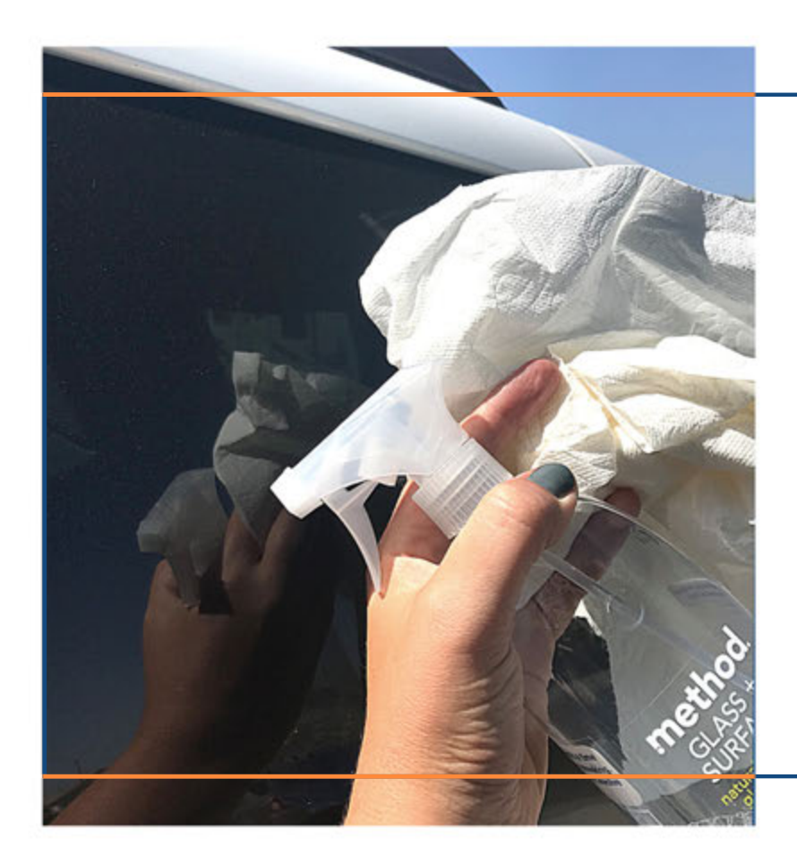
Step 1 : Clean your windows or your whole car if needed.