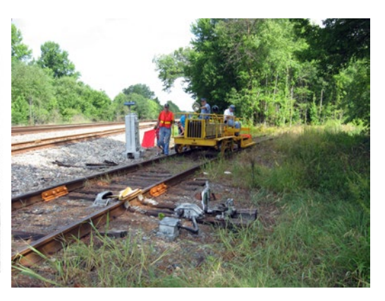
"Promoting Railway History and Preservation"