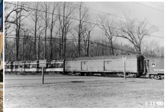
"Promoting Railway History and Preservation"