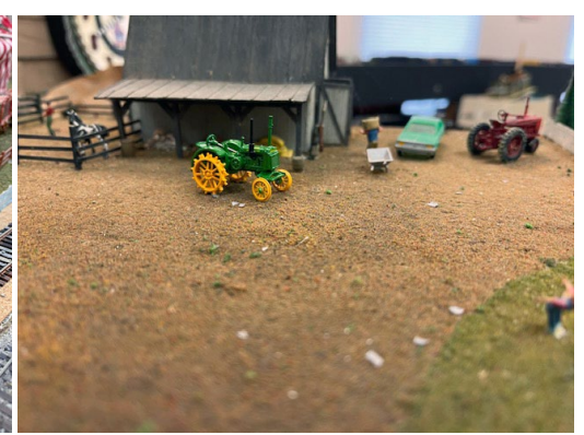
"Promoting Railway History and Preservation"