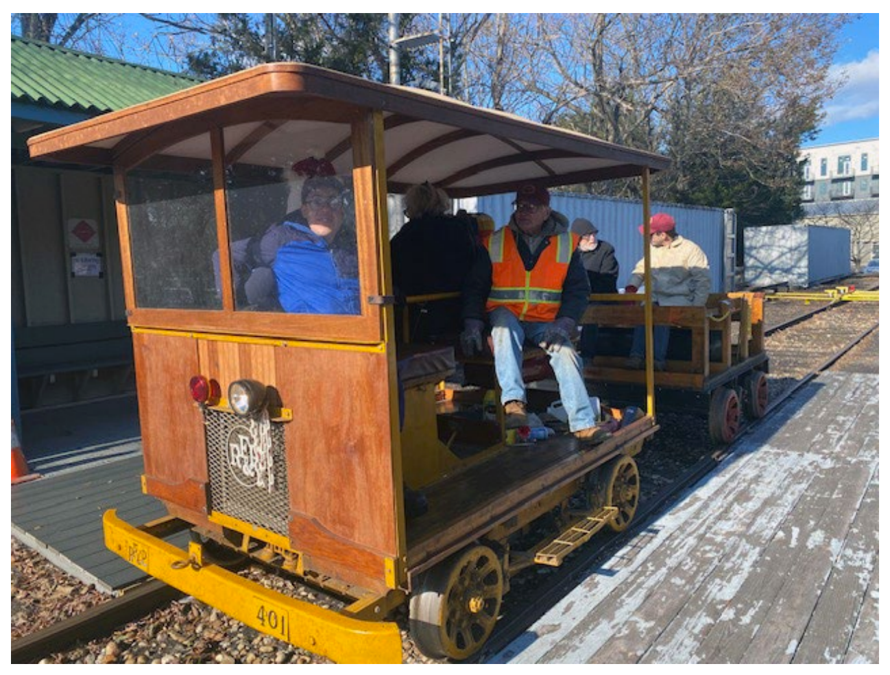
RF&P 401 Leaving Deep Run Station with a very short train.