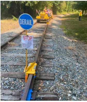
Top Left: We still install our derailer as normal. Sewer Line contractor still doing lot of digging and building in the area. Normally they don't work on Saturday, but train crew need to be vigilant for any construction that may affect rails.