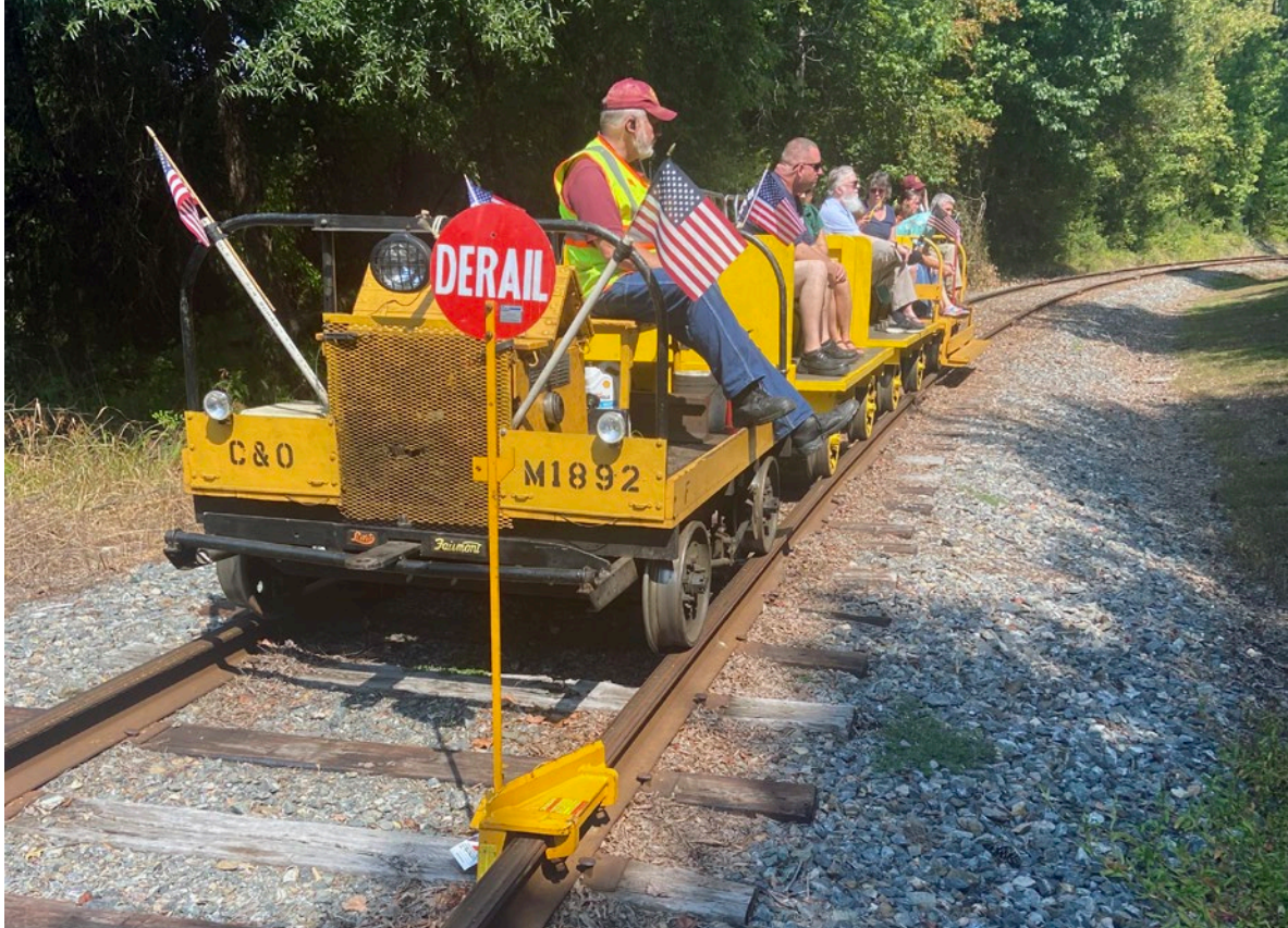
LYT stopped at contractors (sewer Line) derailer.