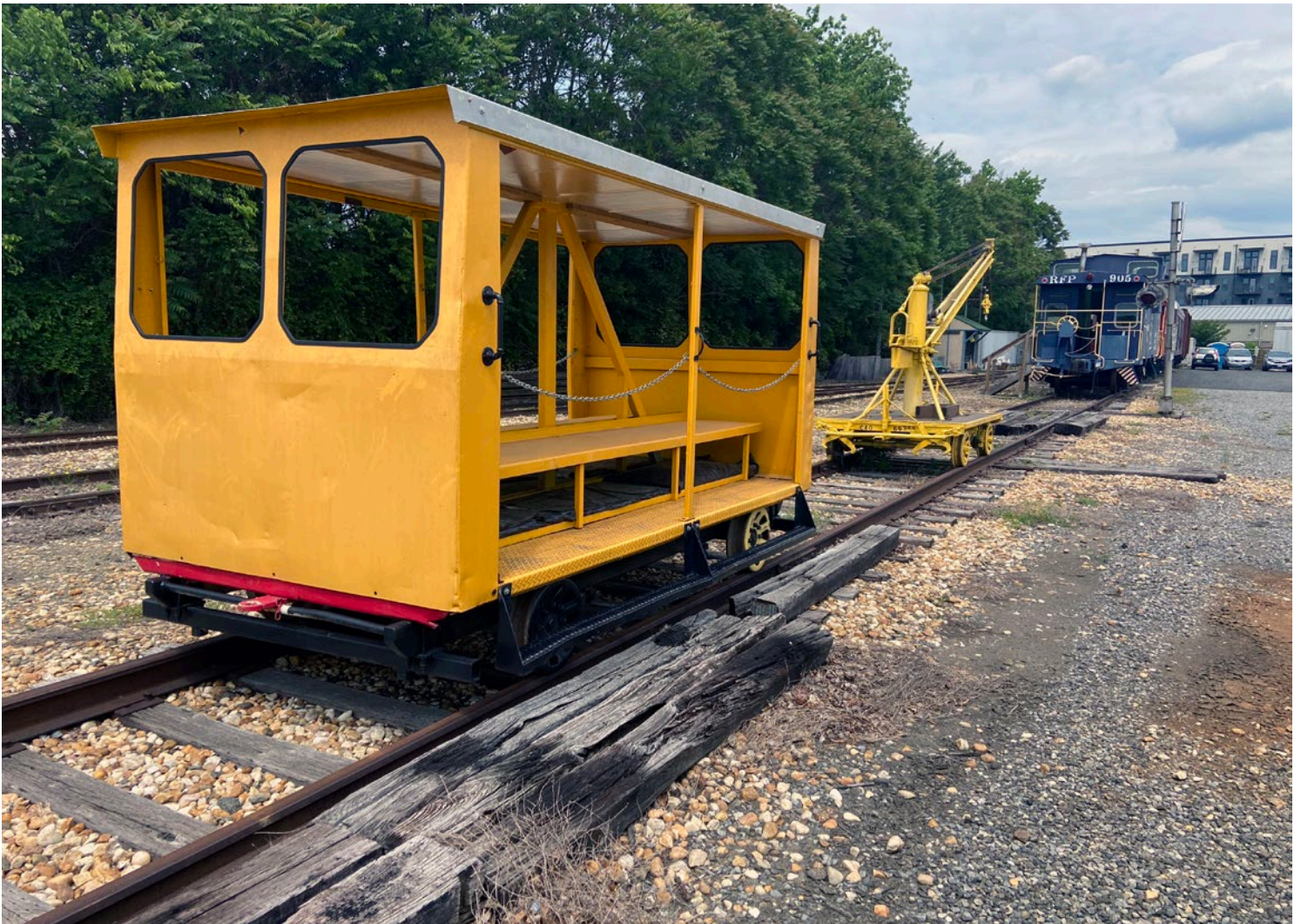
The above picture it is of the ODC car (school Bus) we leased it May 7, 2024 two years and lot of work, lets use it.