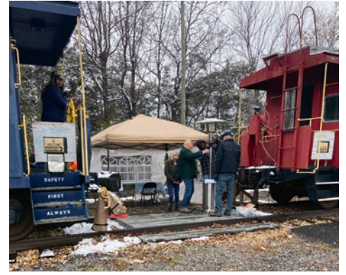
Top Right: Setting up Birthday party parking lot side