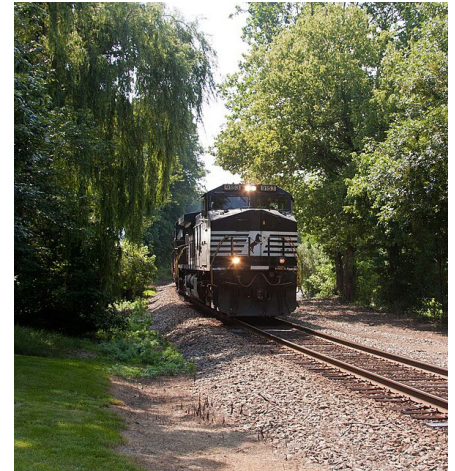
Norfolk Southern C40-9W #9153 pulls a manifest through Markham, VA on the B-Line in 2011.

After the 1982 merger, "the Weed Line", as it was affectionately called by its crews, only ran a series of road locals linked relay-race like from end to end. This was a result of Norfolk Southern after the merger prioritizing the parallel ex-N&W mainline from Roanoke to Front Royal and Hagerstown via Page County, and the ex-Southern mainline from Atlanta to Washington DC through the Virginia Piedmont region.