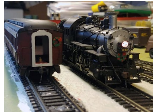
Bottom Center Right: Even the model train crews have the spirit.