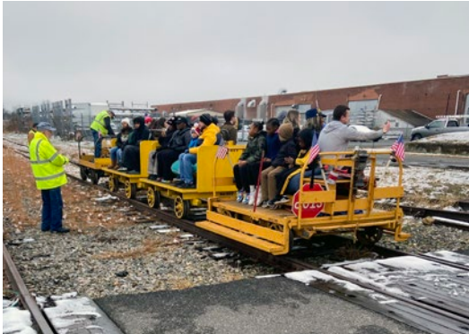
Top Center Left: Conductor giving his- tory of area to Birthday party.