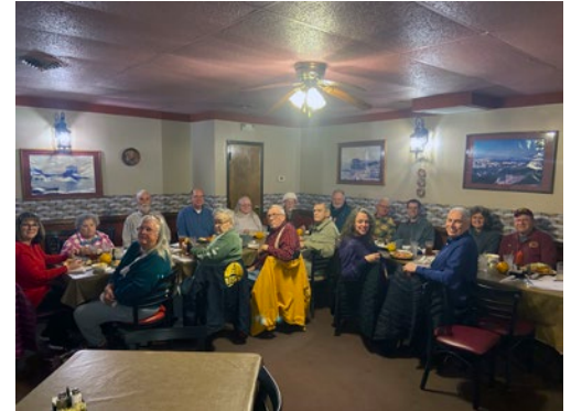
Top Center Right: Christmas meeting at Scafa's.