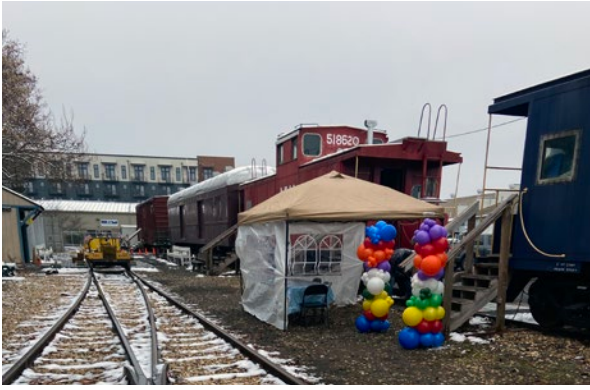
Top Left: Birthday party setup track side.