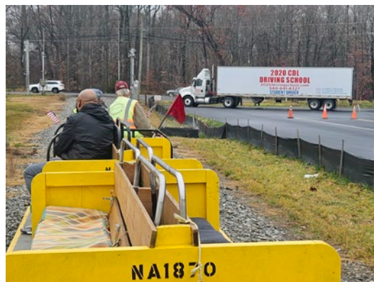
LYT approaches Rt.2 passing the just opened CDL Driving School

Museum closing: We do not plan on closing due to bad weather year round. BUT do not come if roads bad in your area, you decide what is safe for you. SAFETY FIRST! See you next year.