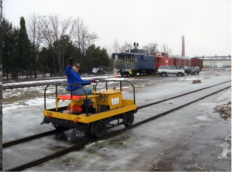
Top Left: Our newly resurfaced parking lot. Top Right: CSX shifting at Deep Run station Dec 13, 2023. Center Left: Kids of all ages love to play in the snow, December 26, 1909 Don with the m1892 near Rt.2. Center Right in the yard (what a change in back ground). Bottom Left: LYT leaving yard rounding curve on Deep Run branch line. Bottom Right: Visitors and crew observe long NB Freight at MP 57.