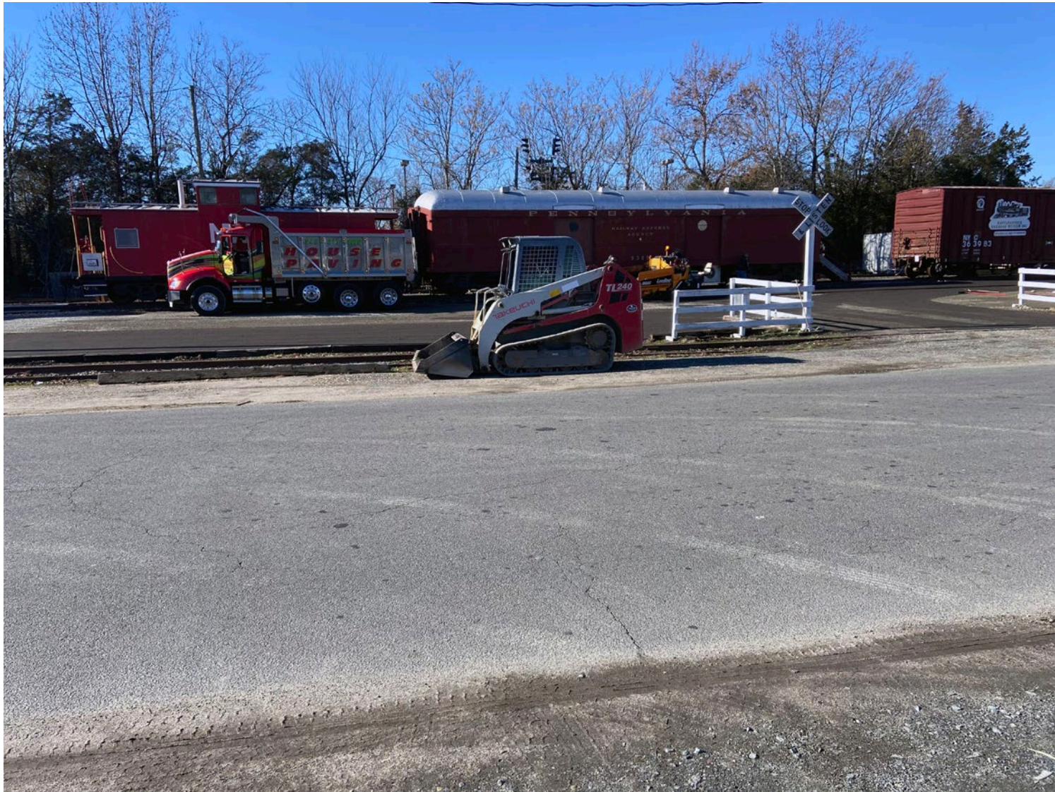
House Paving Co. installing new surface on parking lot 12/12/2023

I will be using 2024 email file next week for Updates. If you do not get an Update next week and have renewed for 2024 Please drop me and email. Picking up steam for a exciting 2024 year, presenting history and enjoying time with our Museum.