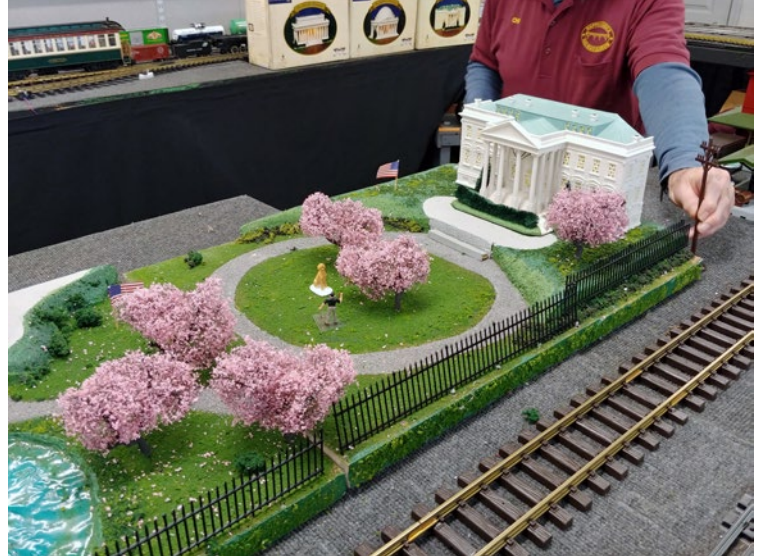
Top Left: next trip our train saw NB Amtrak, great train watching day for visitors. Top Right: Night time view from our new security camera of Main street crossing being repaired, it does cover 360 degrees! Middle and Bottom: Cherry blossoms are blooming right on time at RRM.

“Promoting Railway History and Preservation”