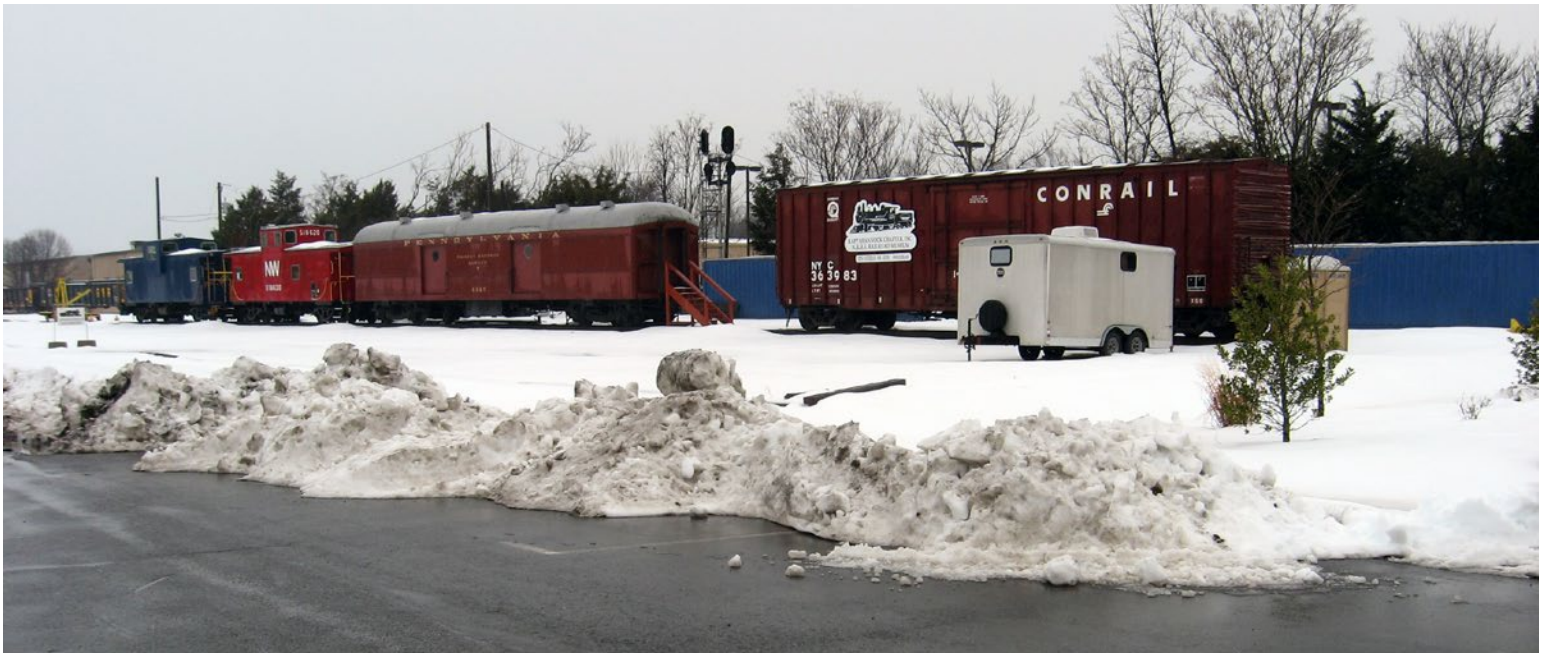
Flash Back, Feb. 15, 2014 - 8:39 in morning, always amazing how much we have changed and grown. We should keep growing if we all help.

Jim Keehner Editor Rappahannock Railroad Museum