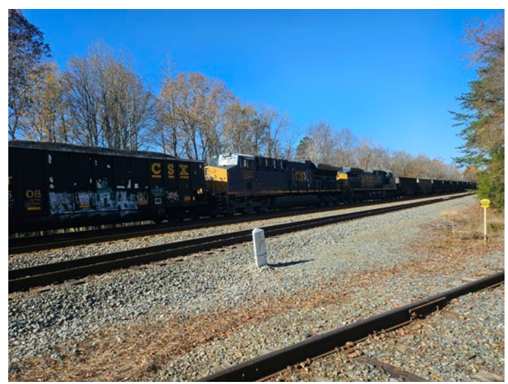
Member Alan watched SB loaded coal train bound for Newport News with Mid train helpers when he was unlocking switch.

Note: I had to rebuild the Update address file due to hitting wrong key, my bad. Hope it is correct and I did not leave anyone out. Let me know if see any corrections that are needed. Stay warm and be safe.