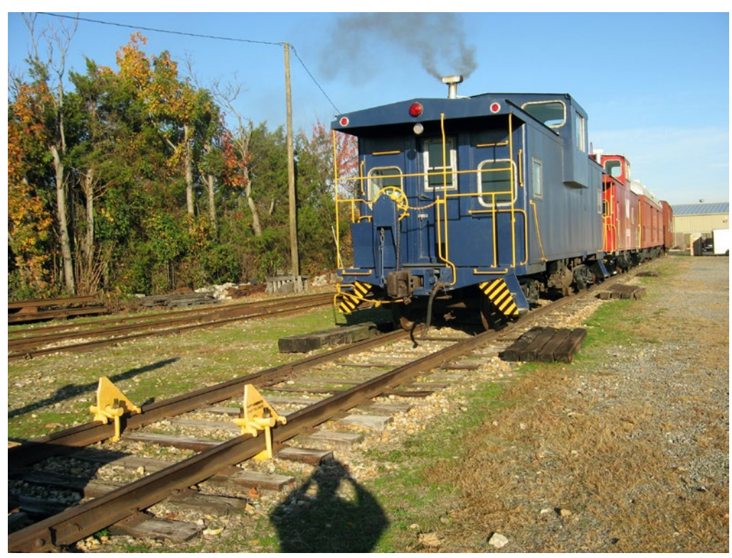
Flash back to Nov. 11, 2013, this is where we meet and kept warm. That was the only heat we had but it did a great job. "Home away from Home"