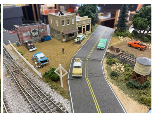
"Promoting Railway History and Preservation"