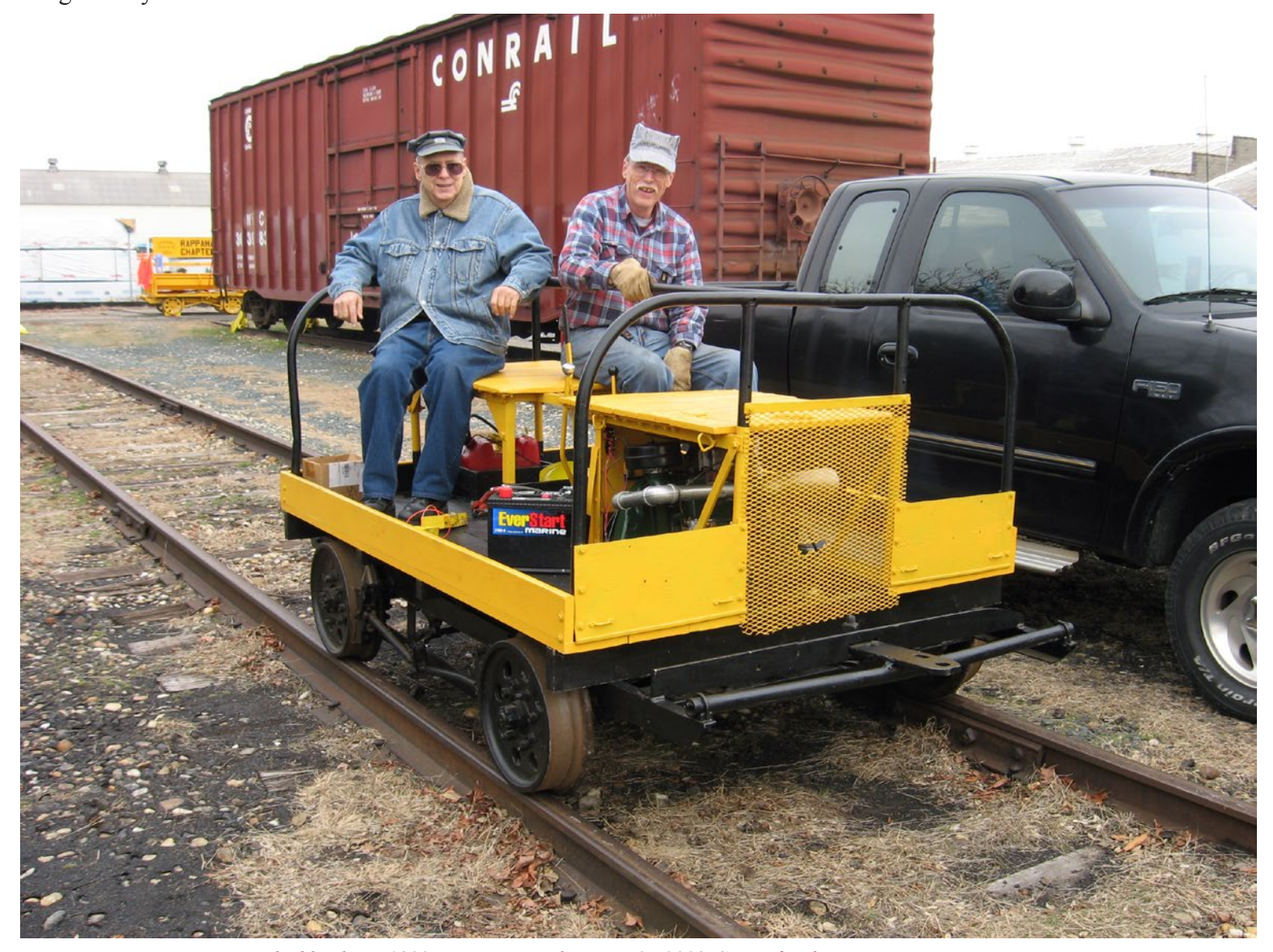
Flashback: M-1892 Moving on rail on Dec 27,2008. Start of rail operations at Museum.

Next week we will start our 25 year at this location, we have had good times and troubling times but what a outstanding Museum we have built. I am sure we will have good and bad times in the future but as we ALL work together the good days will outnumber the few bad ones. Welcome to 2025