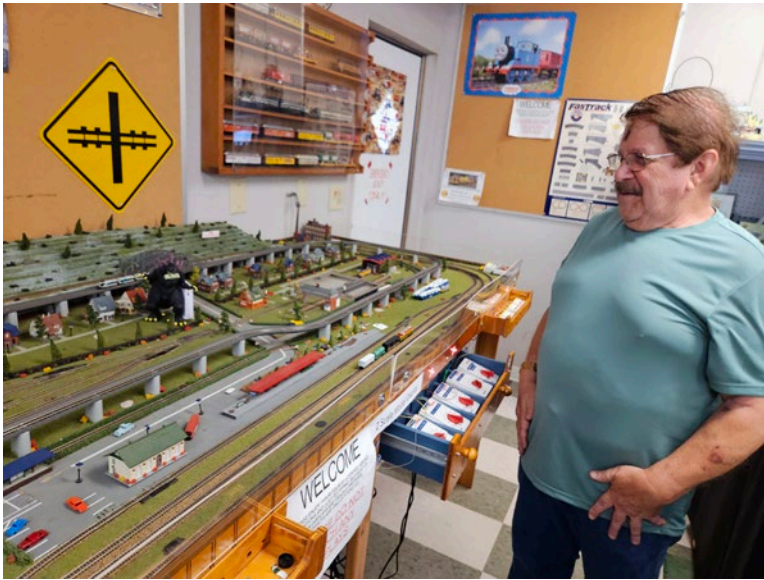
Left: Godzilla sounds off while eating a car (Z).