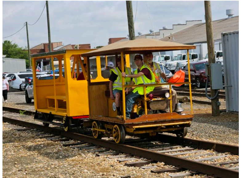
Right: #401 returns to station after test run with passenger car.