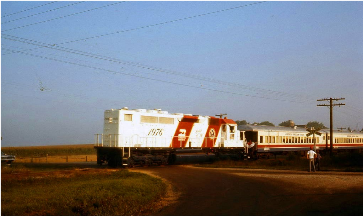
Holcomb IL. BN 1776 an SDP40 8/24/1975

The triumph of the steam-powered American Freedom Train was, indeed, the only nationwide celebration of the Bicentennial. It was pulled by steam locomotives in the age of the diesel, and would improve on the three display cars of its predecessor, the 1947 Freedom Train. The American Freedom Train would feature twelve display cars, ten that visitors would go aboard and pass through and two to hold large objects that would be viewed from the ground through huge “showcase” windows. The display cars were filled with over 500 precious treasures of Americana. Included in these diverse artifacts were George Washington’s copy of the Constitution, the original Louisiana Purchase, Judy Garland’s dress from The Wizard of Oz , Joe Frazier’s boxing trunks, Martin Luther King’s pulpit and robes, and even a rock from the moon.