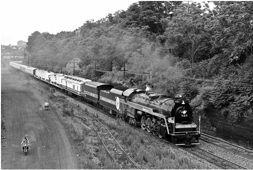
The American Freedom Train, powered by former Reading Company 4-8-4 2101 (renumbered 1 for its Freedom Train duties) passes the site of the Pennsylvania Railroad's 28th Street engine terminal as it arrives in Pittsburgh, PA, on July 7, 1976.

Time for another take on the American Freedom Train, this time dealing less with the politics and more with the overall concept and it's impact on the tourist railroad operations throughout the United States.