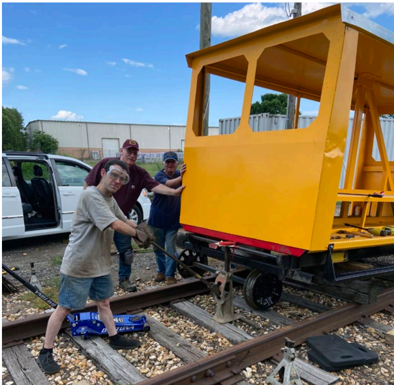
RRM Shop Crew Pull axle and wheels