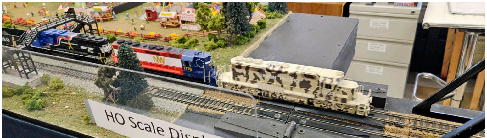
Special Commemorative Motors pull coal train (HO)

Railfans owe an immeasurable debt of gratitude to the AFT. The successful operation of its three steam locomotives on America’s dieselized railroads produced a rebirth of steam in excursion train service that flourished in the 1980’s and 90’s and continues today.