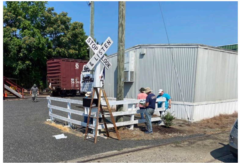
Top Left: Member Dan replaced rotten arm rest at station waiting area. Top Right: Train stopped and Leo sets big turtle free, we watch out for all our little friends, Center Left: loaded LYT and test train with new crew car at MP57. Center Right: scout troupe #173 painting entrance fence, Bottom Left: Scout members put finishing touches on painted station benches. Bottom Right: B-60 scrapped, power washed, patched ready for primer, painting and lettering.