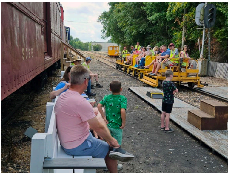
Left: LYT arrives at Deep Run Station with another full load of guest.

“Promoting Railway History and Preservation”