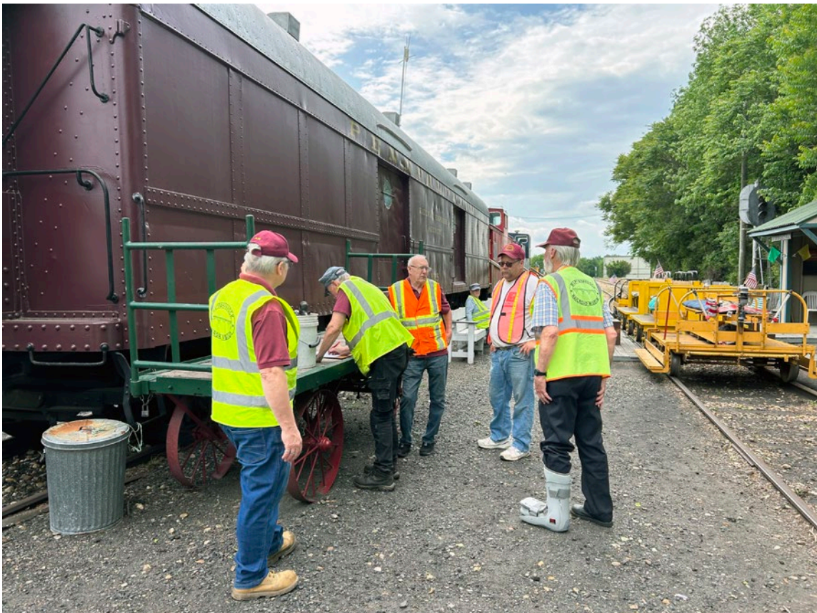
Certified crew signing forms for test run to MP57, note green flag on station.