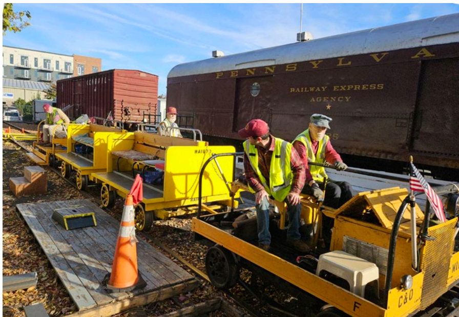
Test train leaves station for safety run in back of park (no visitors on board).

There were a lot of good photo action scenes Saturday. I was not able to get any. If you take any great shots at Museum, you are welcome to send them to me and I will put some of them in Update. Enjoying History.