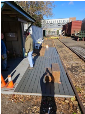
Bottom Center and Right: Flash backs December 2, 2011, Crane masters rebuilding Mills Drive Crossing.