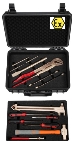
EAI0912FW ATEX tool kit with 14 non-sparking tools for fire fighters / hazardous goods