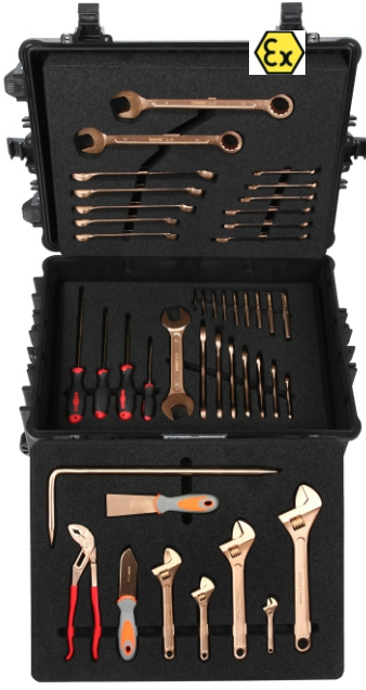
EAI0499BC ATEX tool kit with 43 non-sparking tools made for a Heraeus