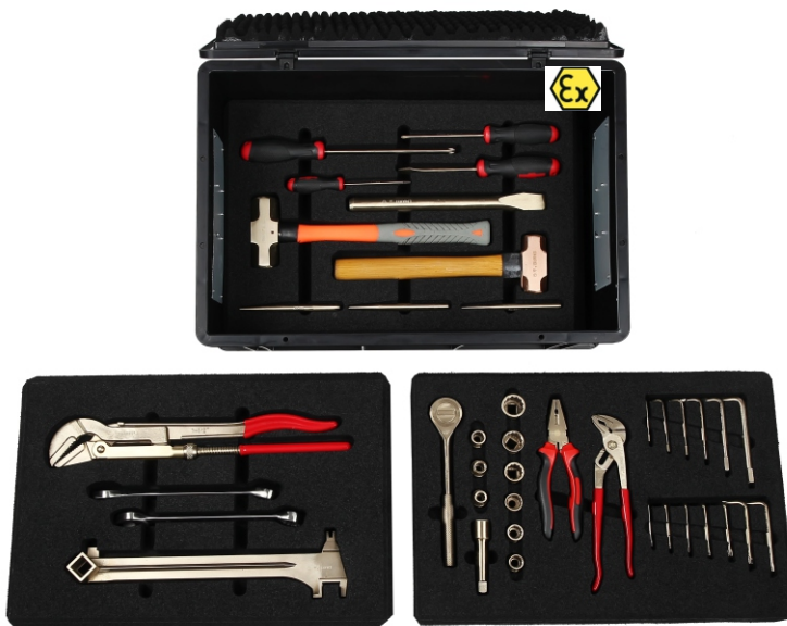
EAI0913AL ATEX tool kit with 44 non-sparking tools, altogether 47 tools for fire fighters / hazardous goods, latest version