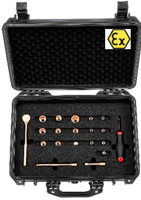
EAI0496BC ATEX tool kit with 20 non-sparking tools made for Hyundai Engineering