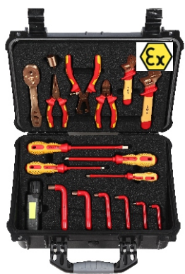
EAI0603BC-R ATEX tool kit with 17 non-sparking tools for refrigeration engineers