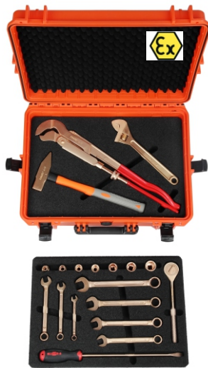
EAI0600BC ATEX tool kit with 19 non-sparking tools for sewage treatment plants