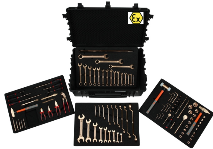
EAI0578BC ATEX tool kit with 108 on-sparking tools made for different industrial applications