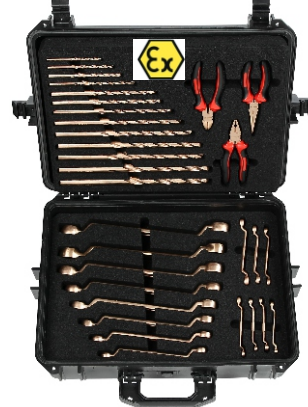
EAI0498BC ATEX tool kit with 31 non-sparking tools made for Hyundai Engineering