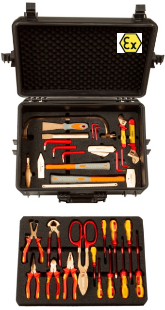
EAI0175BC ATEX tool kit with 31 non-sparking and electrically isolated tools

EMAREI Safety Tool Sets: Made in Germany