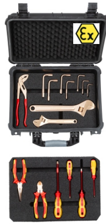
EAI0910EX ATEX tool kit with 16 non-sparking tools also available in Aluminum-Bronze