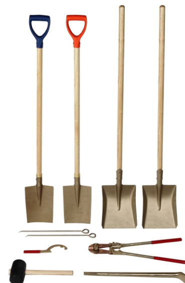
EMY34BC+1 ATEX tool kit with 34 non-sparking tools