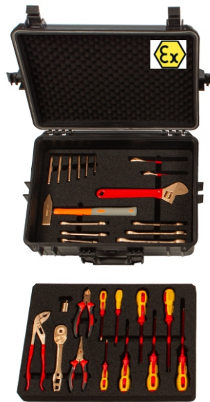
EAI0594BC ATEX tool kit with 29 non-sparking tools for refrigeration engineers