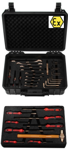
EAI0500BC ATEX tool kit with 34 non-sparking tools