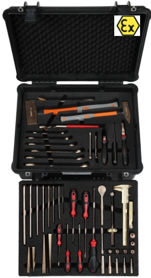
EAI0580BC ATEX tool kit with 49 non-sparking tools made for Glock Austria