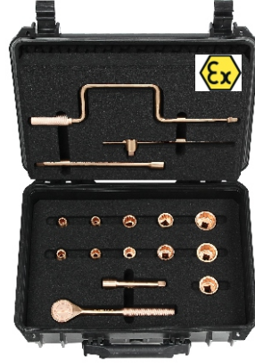
EAI0497BC ATEX tool kit with 16 non-sparking tools made for Hyundai Engineering