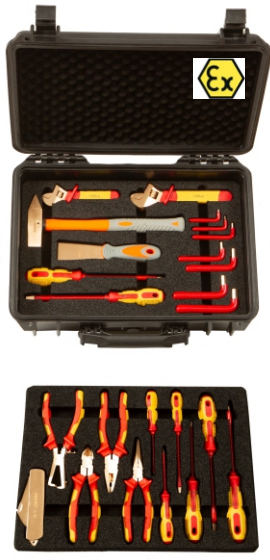
EAI0176BC ATEX tool kit with 34 non-sparking and electrically isolated tools