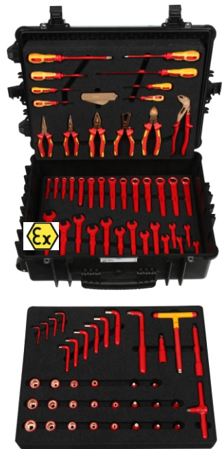
EAI0579BC-H ATEX tool kit with 80 non-sparking and electrically isolated VDE tools