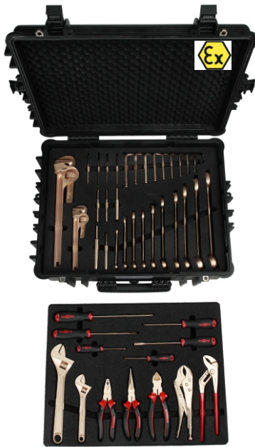
EAI0582BC ATEX tool kit with 44 non-sparking tools made the gas industry