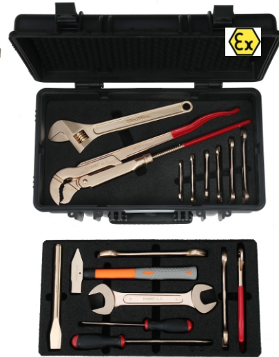
EAI0595BC ATEX tool kit with 16 non-sparking tools made for Westfalen Gas