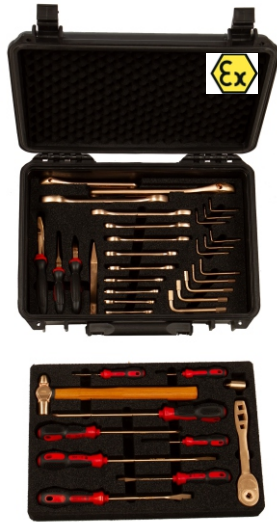
EAI0572BC ATEX tool kit with 38 non-sparking tools for refrigeration engineers