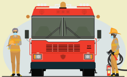
Firefighters age 50 & older.