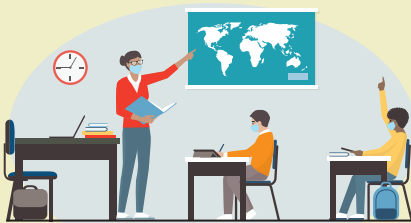
K-12 school employees age 50 & older