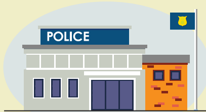
Sworn law enforcement officers age 50 & older.