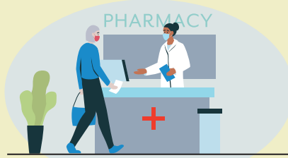
People age 60 & older.