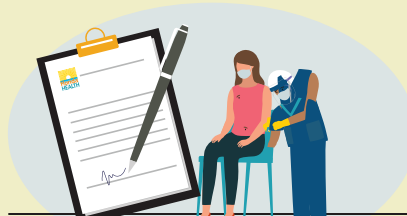
People determined by their physicians to be extremely vulnerable to COVID-19.*