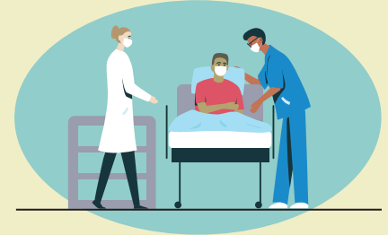
Health care personnel with direct patient contact.

PERSONNEL INCLUDE BUT ARE NOT LIMITED TO: