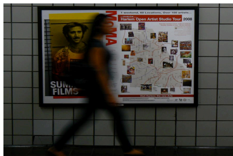
Size of ad on map

artHARLEM is an artist-run, community arts organization dedicated to increasing comprehension of contemporary art. We are dedicated to making the arts of Harlem a prominent part of the city's culture. More information about us is available at our website, www.artHARLEM.org