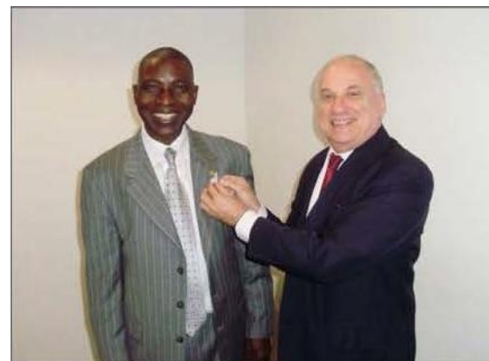
The CEO of Africa Heritage Foundation Chief Tunde Adetunji and Leslie Kikoler, Executive of the Brazilian Olympic Committee in Rio de Janeiro performing the official pinning of the Olympics 2016 at the Brazilian Olympic Secretariat in Rio de Janeiro - 2010