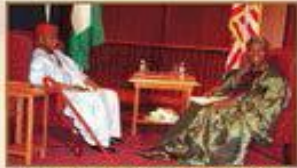
Royal Father Oba David Obateru Otigboji The Olomofe Of Owo-Nigeria On Africa Heritage TV