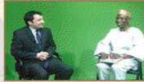
Consul General Paul Gorman of Ireland on Africa Heritage TV