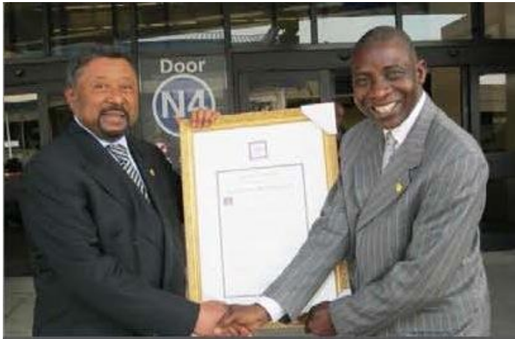
The Historic visit of the Chairman of the African Union Commission, H.E. Dr. Jean Ping to the city of Atlanta, Georgia