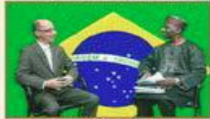
Consul General Adriano Senou Ambassador of Brazil on Africa Heritage TV