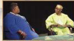
Dr. Evelyn Wynn Dumas, Mayor, City of Riverdale on Africa Heritage TV