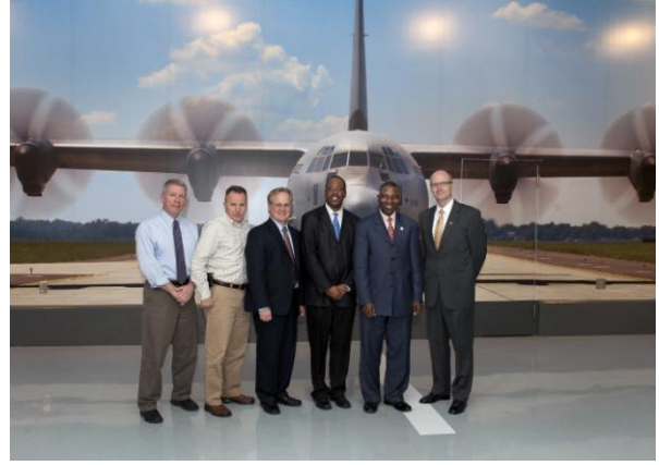
Group picture with Ambassador Tunde Adetunji