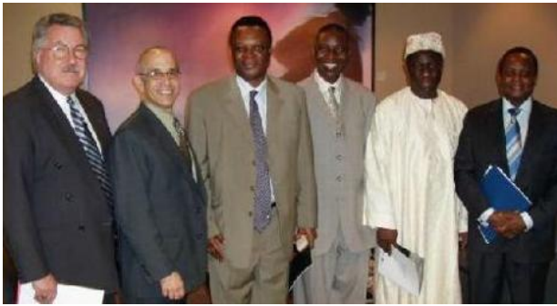
Africa Union Executive Visit to Atlanta 2007 Africa Heritage Foundation Event Makes History