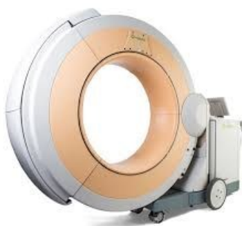
O-arm imaging & Navigation system