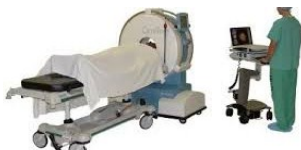
Mobile CT scanner