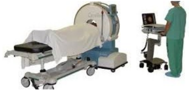
Mobile CT scanner