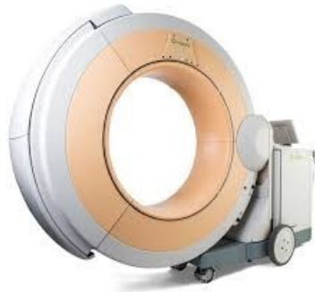
O-arm imaging & Navigation system