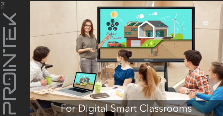
For Digital Smart Classrooms

Disclaimer: Due to product configuration and manufacturing process, actual body size/body weight may vary, please refer to the actual product. The product images in this specification are for illustrative purposes only, may be adjusted and revised in order to match the actual product performance and specifications. In the event that such changes and adjustments are necessary, no special notice will be given. The actual product effect (including but not limited to appearance, color and size) may vary slightly. Please refer to the actual product. In order to provide accurate specifications as far as possible, the text expressions and pictures in this specification may be adjusted and revised in real time. The product specification