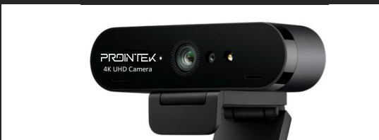
Classroom Camera Solution