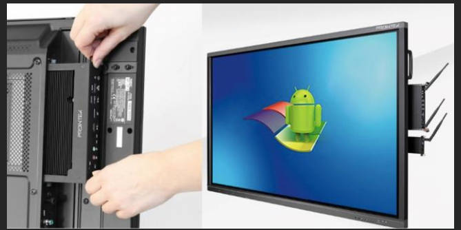
A wide choice of OPS