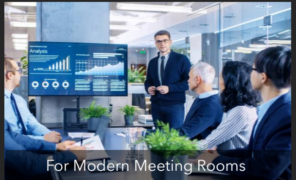
For Modern Meeting Rooms