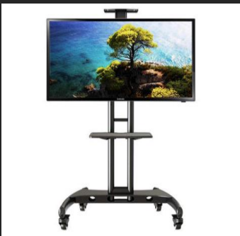
Floor Mount Kit for Panel