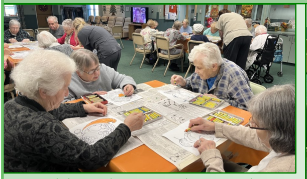
Participants busy at work on a project