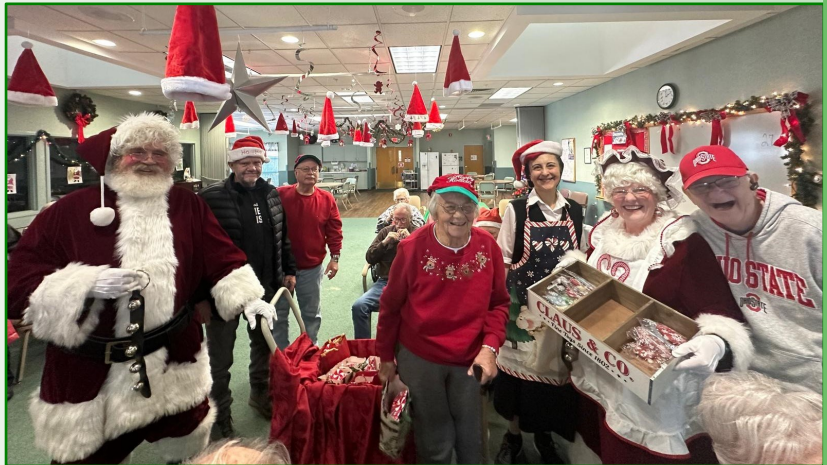
Santa & Mrs. Claus brought gifts and joy to all in the Adult Day Care