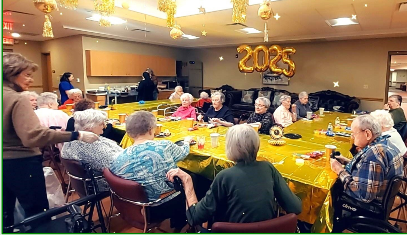
New Year's Dinner