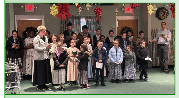
The Mennonite Youth Choir enchanted participants with their beautiful singing