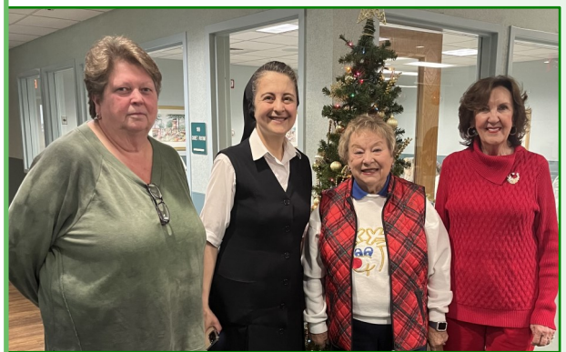
The Immaculate Heart of Mary Garden Club provided an adorable Christmas craft for ADC participants to complete