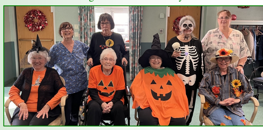
Creative costumes brightened the Halloween party