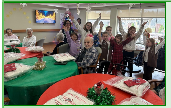
The Girl Scouts brought joy with their caroling