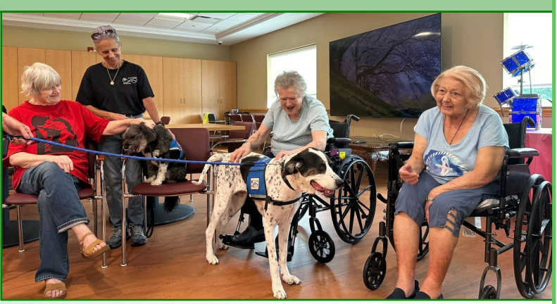
Residents loved the therapy dogs from Furever Friends