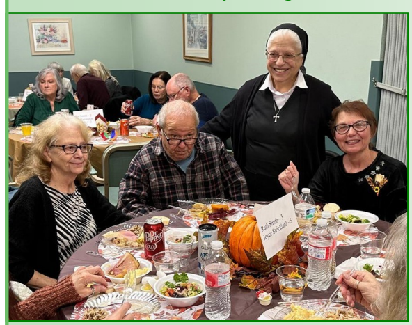
Participants & families enjoy a delicious Thanksgiving luncheon