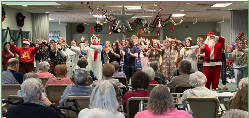
Austintown Fitch High School choir amazed participants with an extraordinary performance