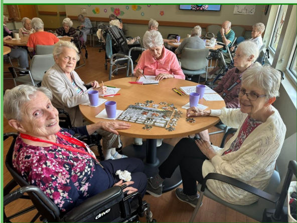
Fun activities in Memory Care