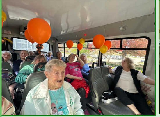
Fall trip to Mill Creek Park