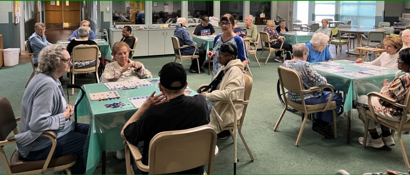
Bingo fun at the Adult Day Care