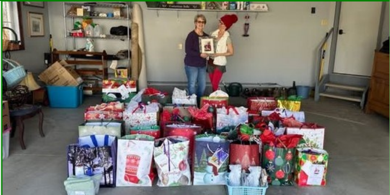
Opal's Spirit of Giving gift bags