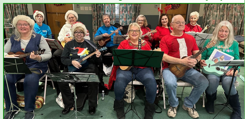
Steel Valley Ukers entertained participants with their festive performance