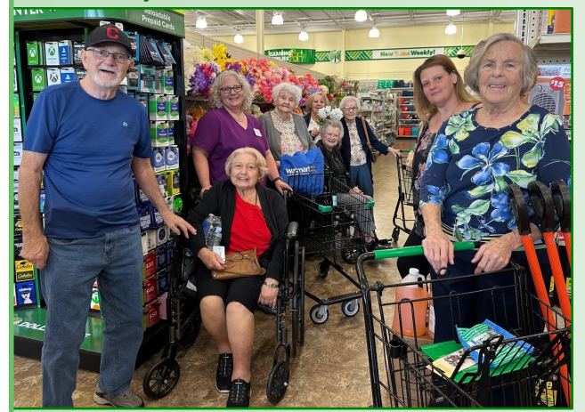
Shopping at Dollar Tree