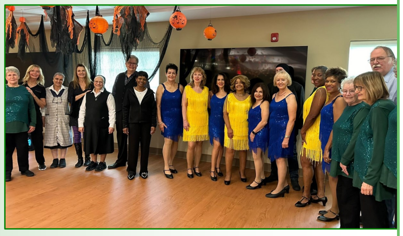
Participants from the Senior Showcase put on an outstanding performance