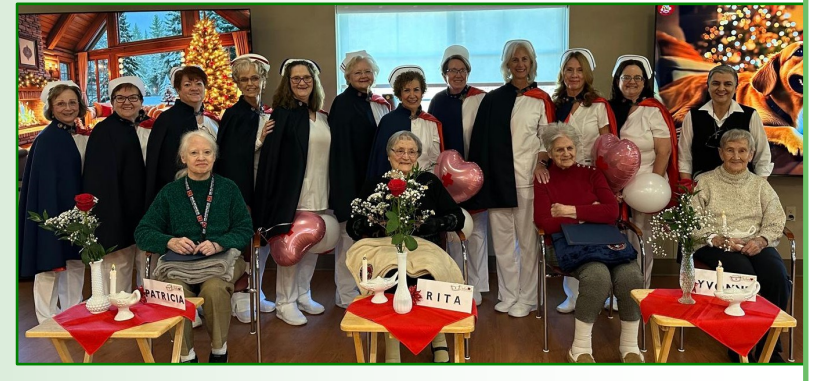
The Nurse Honor Guard honored retired nurses