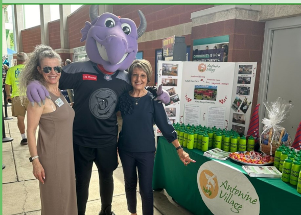
Senior Fair 2024