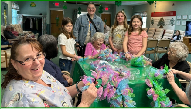
Jackson Milton Elementary students help Adult Day Care Participants create beautiful wreaths