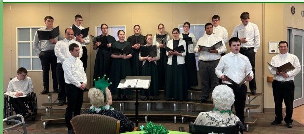
St. Patrick's Day with lovely singing courtesy of the Mill Creek Mennonite Choir