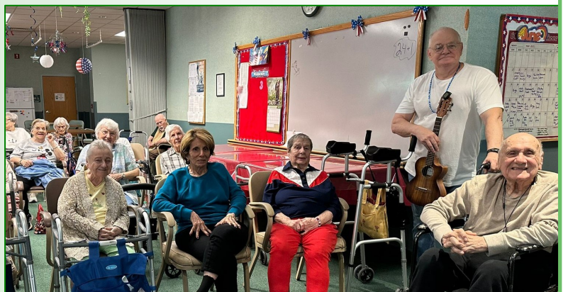
Steel Valley Ukers offer a unique performance to all attending in the Adult Day Care