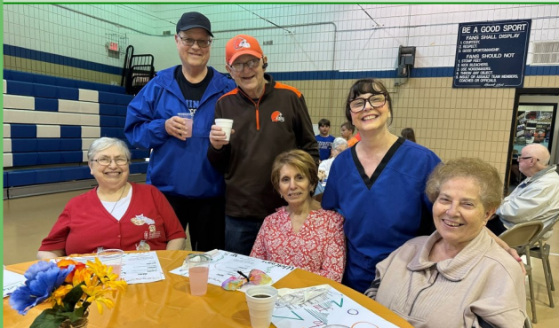
Senior Luncheon at Jackson Milton Elementary School