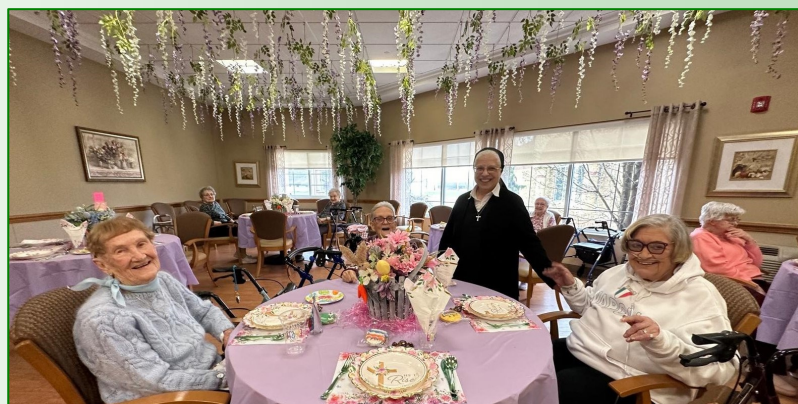
Easter Party & Luncheon with a visit from the Easter Bunny and his helpers