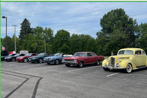
Mahoning Valley Olde Car Club Show