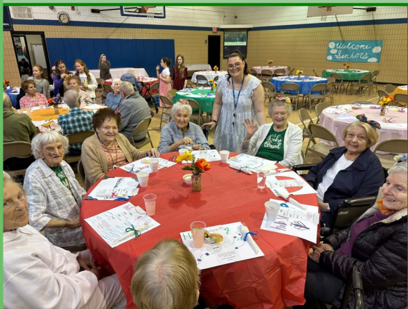
Antonine Village residents at Senior Luncheon at Jackson Milton