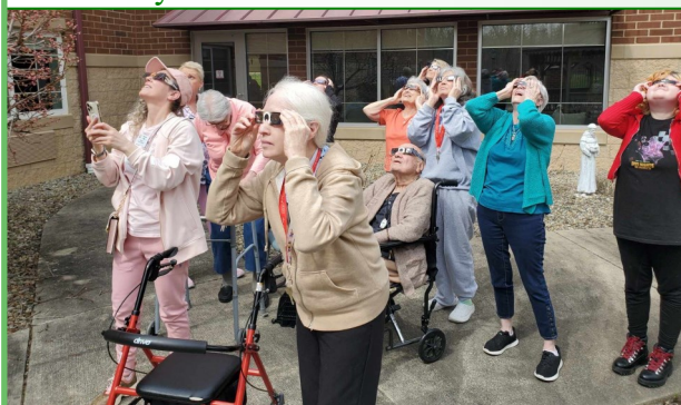
Solar Eclipse 2024