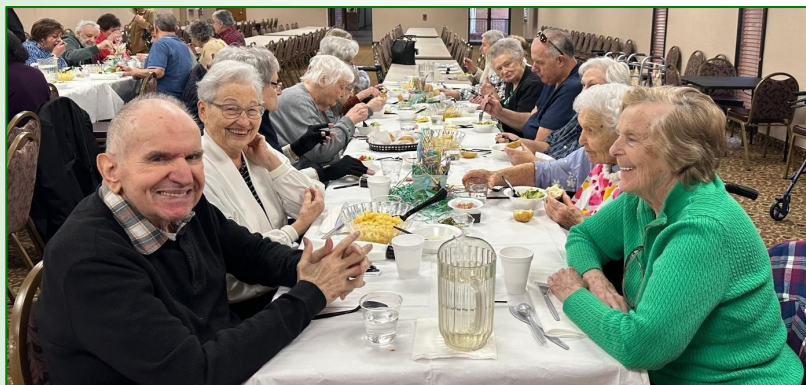
Senior Luncheon at St. Maron in Youngstown