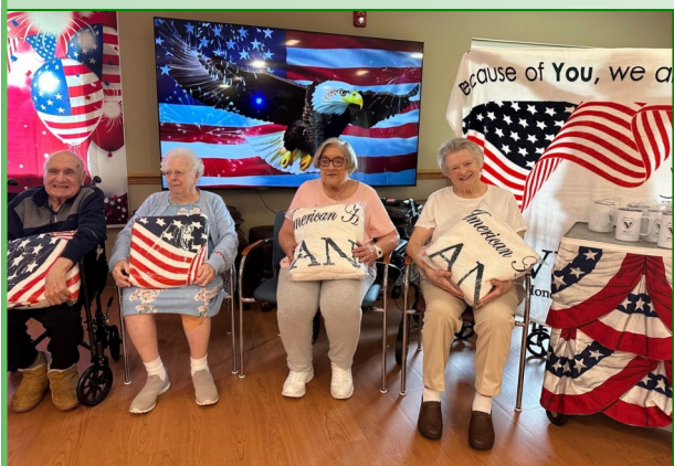
Veterans and family members of veterans honored