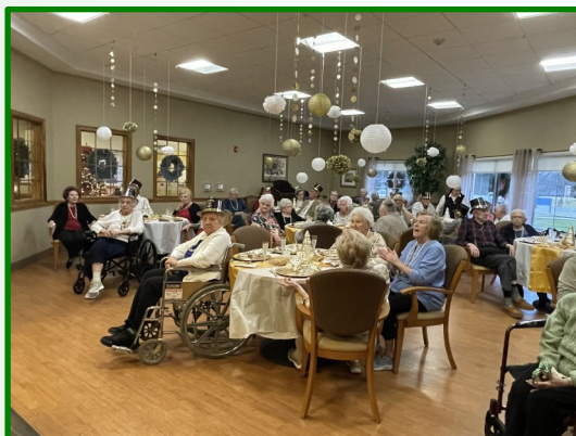
Residents and staff enjoying New Year's festivities