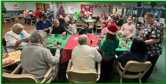
Jackson Milton Elementary School students creating crafts with residents and day care participants as well as singing Christmas carols