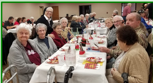
Residents having a wonderful time at the Silver Bullet Christmas luncheon and party at St. Maron in Youngstown