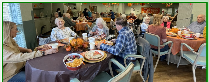
Families enjoying the Thanksgiving meal