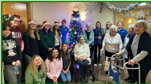
Austintown Fitch High School performing a beautiful mixture of different carols for both residents and day care participants