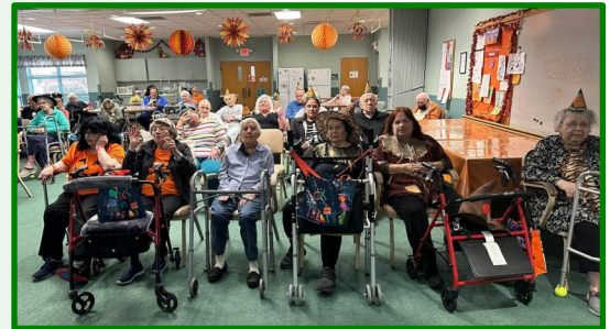
Halloween at the Day Care

Thanksgiving celebrations included delicious food and delightful entertainment. Families of day care participants were also able to enjoy an art exhibition displaying all of the beautiful art work created by their loved ones.