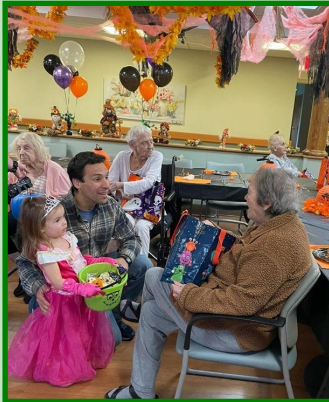
Residents passing out candy & treats