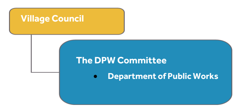
FIGURE 3 - ORGANIZATIONAL CHART

The Village Council in Sebewaing makes all decisions regarding parks in the community. The Village of Sebewaing's Department of Public Works (DPW) operates its parks and recreation facilities. Working under the direction of the Sebewaing DPW Committee, the DPW maintains and plans improvements for its recreation facilities. Figure 3 diagrams the administrative structure that provides recreation opportunities in the Village of Sebewaing.