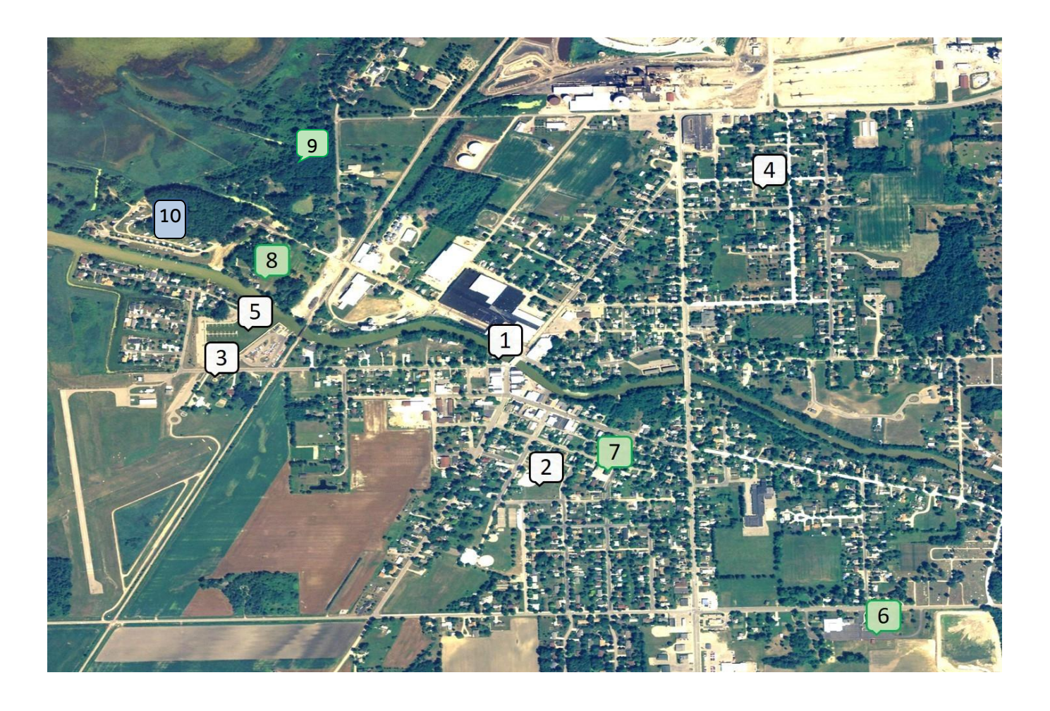
FIGURE 5 - PARK LOCATION MAP