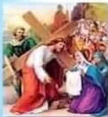
VI Veronica wipes Jesus' Face