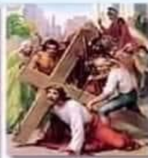
III Jesus falls the first time