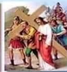
V Simon helps Jesus