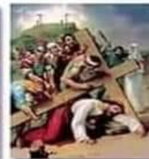
IX Jesus falls the third time