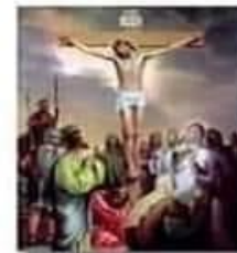
XII Jesus dies on the Cross