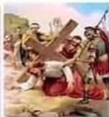
VII Jesus falls the second time