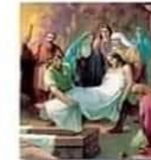
XIV Jesus is laid down in the tomb