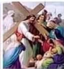
VIII Jesus meets the women