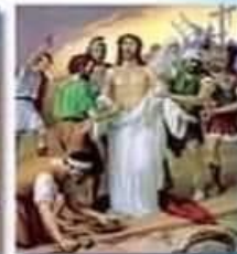
X Jesus is stripped