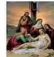
XIII Jesus is taken down from the Cross