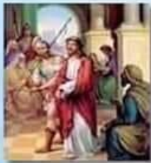
I Jesus is condemned to death.

Because by Your holy Cross YOU HAVE REDEEMED THE WORLD!