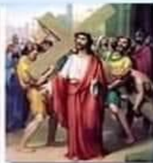
II Jesus carries His Cross