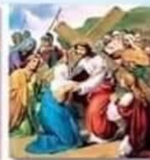
IV Jesus meets His Mother