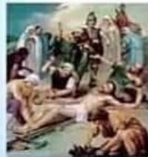
XI Jesus is nailed to the Cross