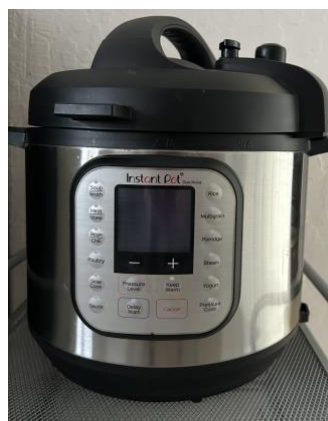
6 Quart Instapot

Please come to join the fun, fellowship with our parish ohana, and enjoy our potluck.