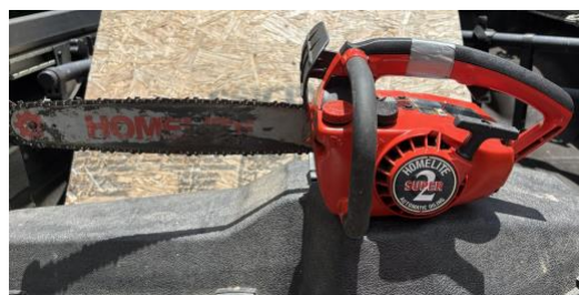
16" Homelite Chain Saw

*+ June 14, 2026 * 11 th Sunday in Ordinary Time+*