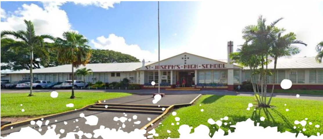
St. Joseph School

God said to Noah and to his sons with him: See I am now establishing my covenant with you and your descendants after you.