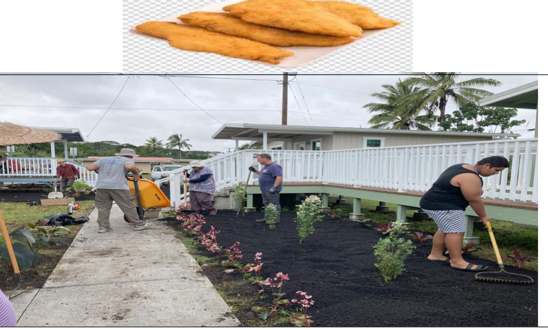
Mahalo nui loa for all the helping hands doing stewardship. Your generosity with your time and work has made a difference in the lives of the people living in the Sacred Heart Kupuna Housing.

Our Lenten Fry enables you to be able to have dinner after a day of fasting and prayer. You are free from making dinner for the night.