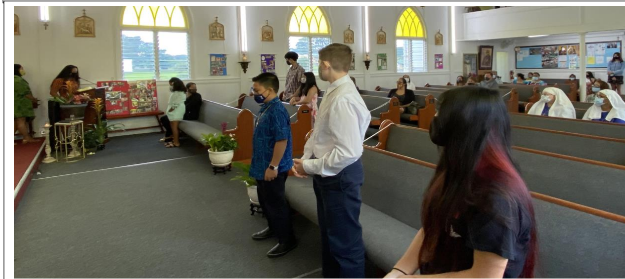
Presentation of Candidates receiving Sacraments in December