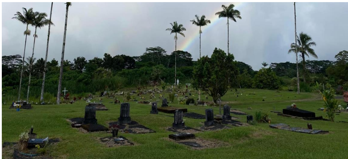
Sacred Heart Graveyard

A heartfelt Mahalo to everyone who will join in unity to Malama Ohana.