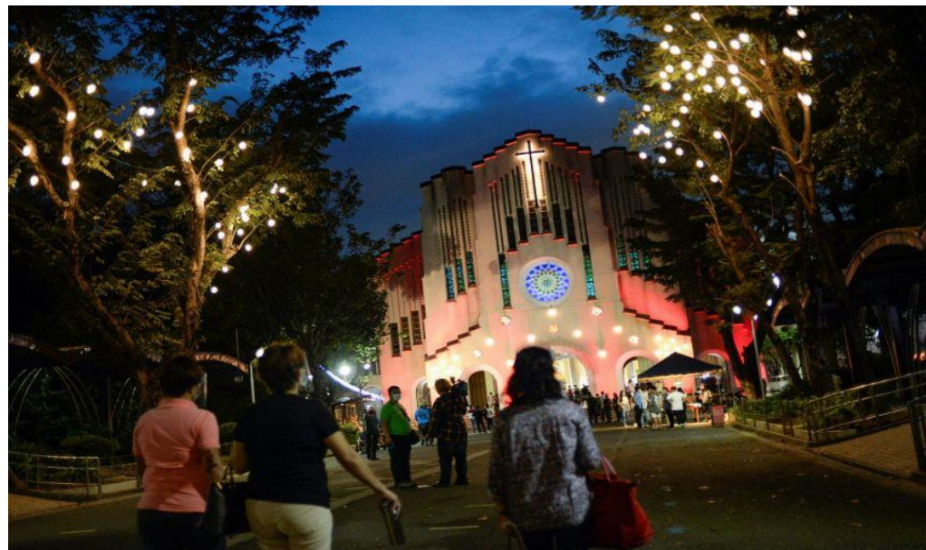
Confirmation December 15, 2020