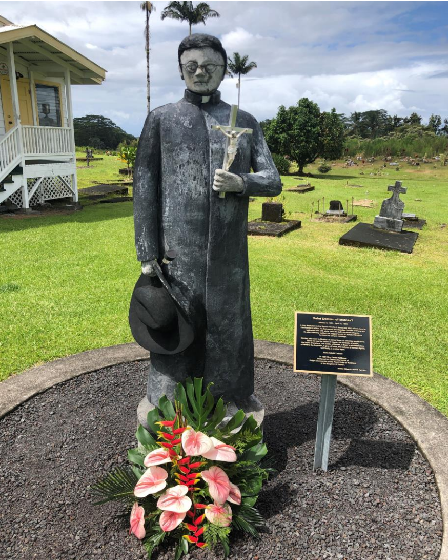
SAINT DAMIEN OF MOLOKAI