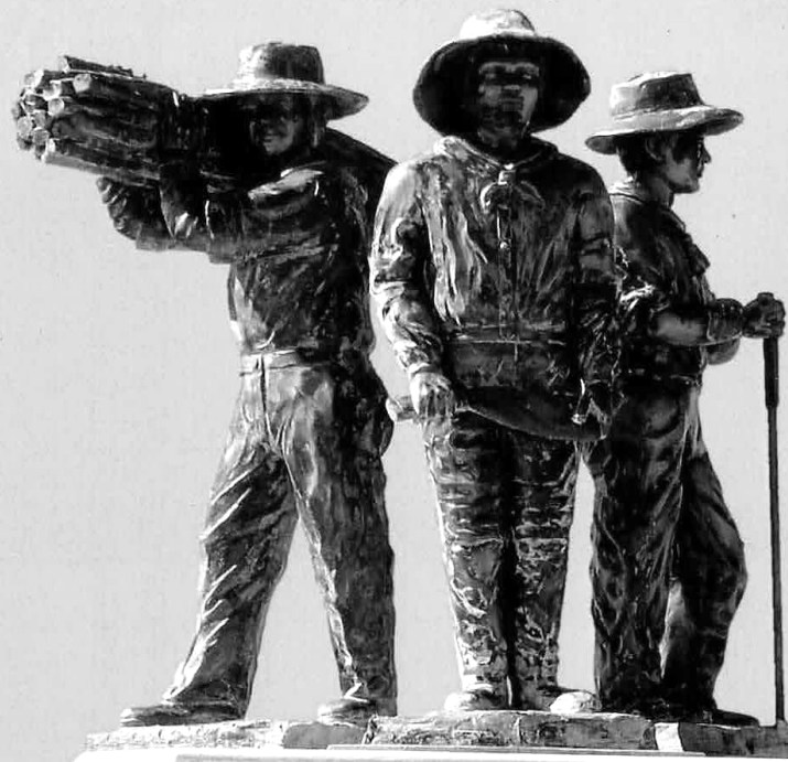
SAKADA MONUMENT, PORT SALOMAGUE, CABUGAO, ILOCOS SUR, PHILIPPINES