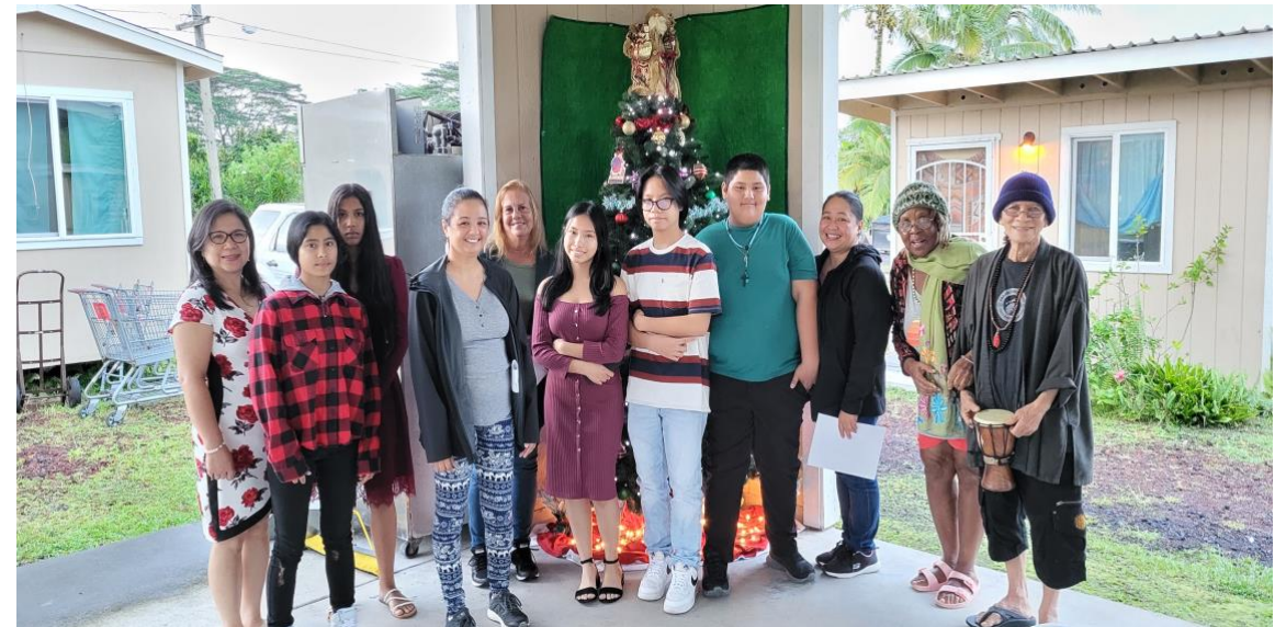
Our youth, parents and Youth Formation leaders.