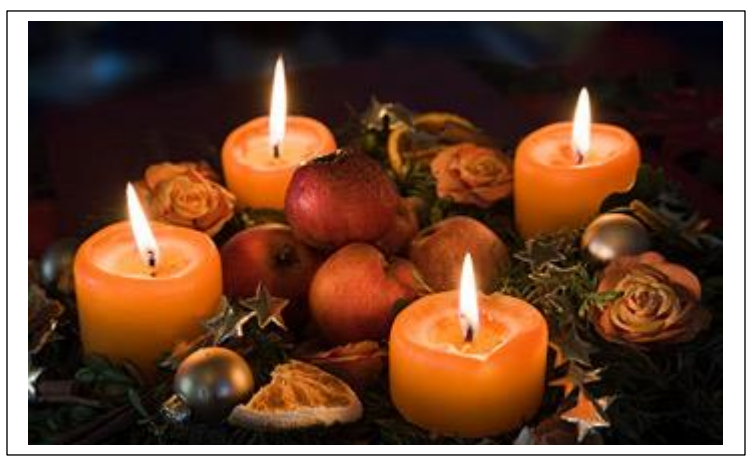
An Advent wreath with four burning candles.

The fourth and last sunday of the advent season is on December 19, 2021. The day is called the Fourth Sunday of Advent. The fourth candle is lit on this day along with the first three. It is the Angel's candle, reminding of the heavenly hosts that proclaimed Christ's arrival with "Behold, I bring unto you good tiding of great joy!"