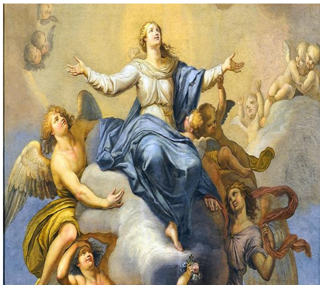
ceiling of the Assumption of Mary in Santa Maria Immacolata a via Veneto,