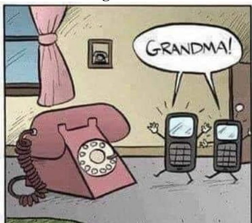
Sign of Times * Ruth Institute

“The hand of the Lord feed us,” says the psalmist, “he answers all our needs.” Both Elisha’s servant in the first reading and the disciples in the gospel story who witnessed the feeding of the five thousand saw this happen and knew it to be true.