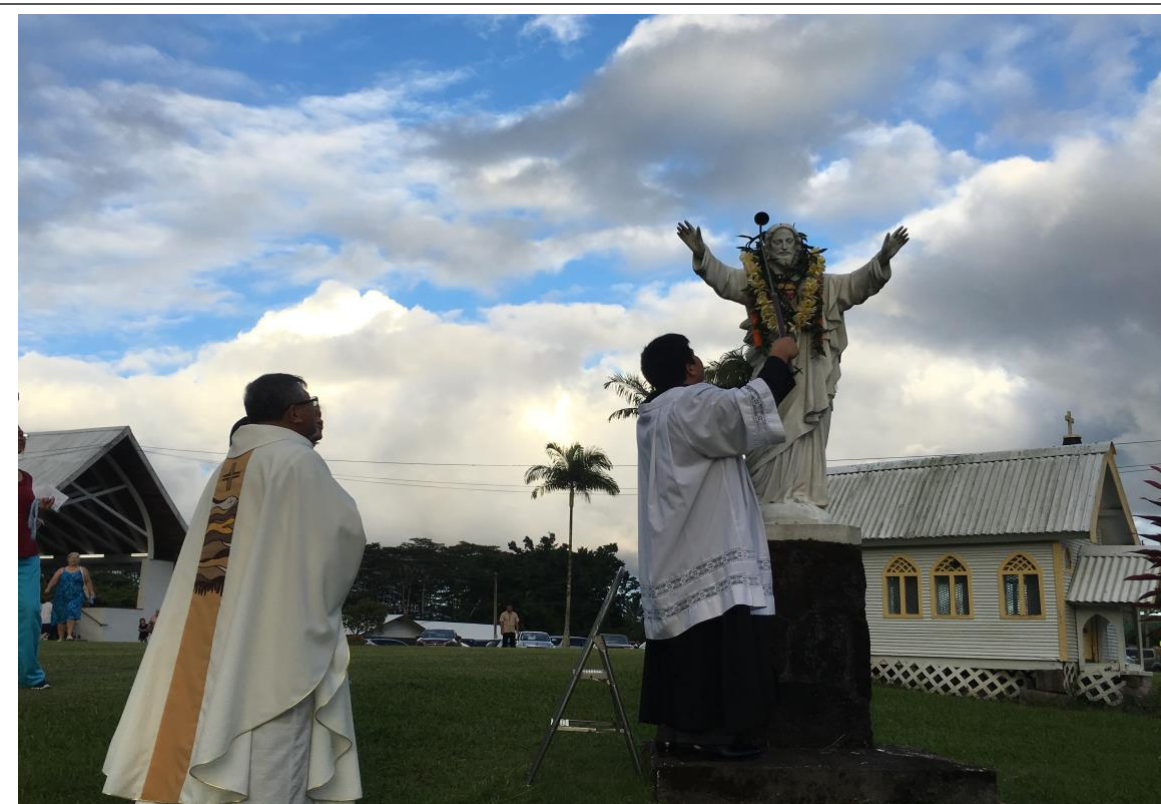
June 26 & 27 th , Lets honor our Patron Saint with leis and rejoice in his Glory