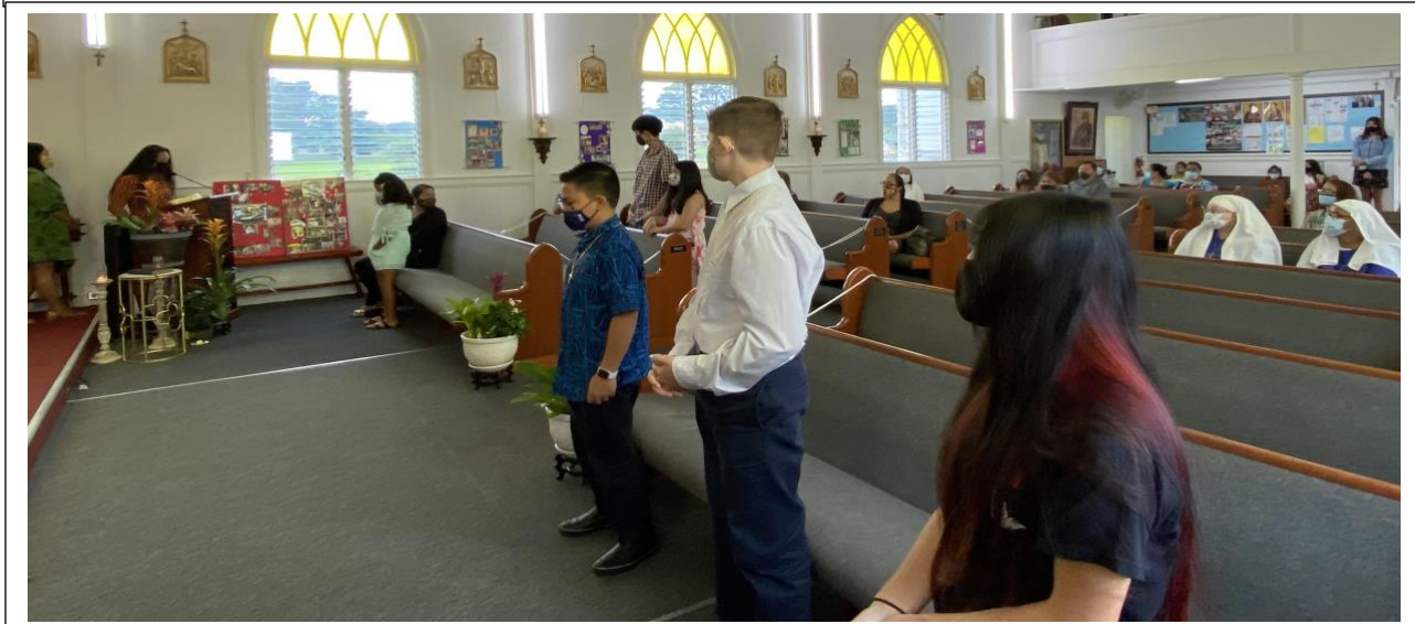
Presentation of Candidates receiving Sacraments in December