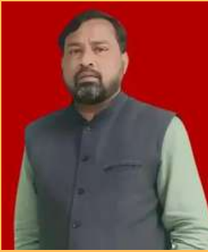
DANISH MASIH SCHOOL HEAD