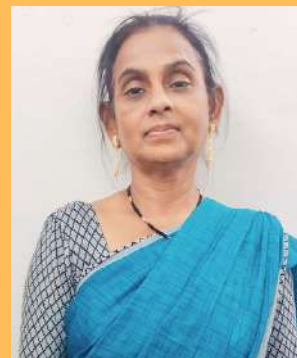
SUDHA PRODUCTION INCHARGE