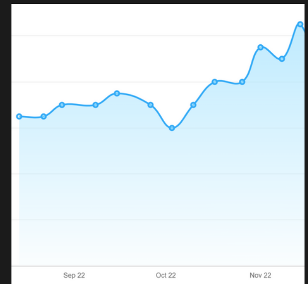
Bench press progress